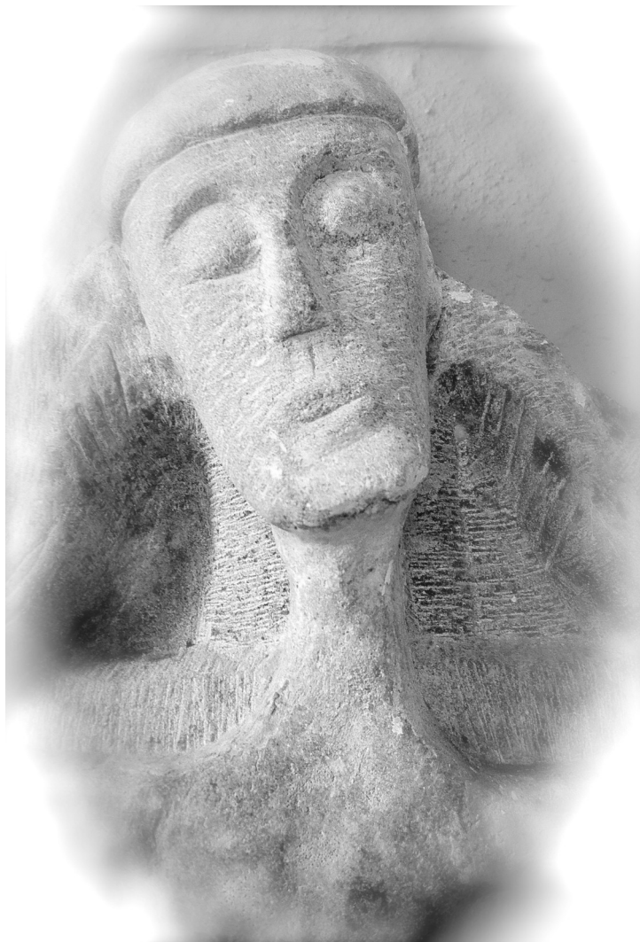
The ancient cross of Toovahera Church - a parish treasure

Dear young people, the decision to believe in Jesus Christ and to follow him is not an easy one. It is hindered by our personal failures and by the many voices that point us towards easier paths. Do not be discouraged. Rather, look for the support of the Christian community, the support of the Church. The Church depends on you! She needs your lively faith, your creative charity and the energy of your hope. Your presence renews, rejuvenates, and gives new energy to the Church.