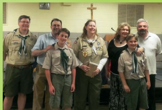
Jewish Religious Emblem

Congratulations to all the scouts that earned merit badges, rank advancements and other special awards!