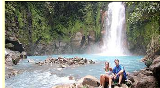
Rio Celeste (Light Blue River) waterfall in Costa Rica