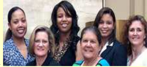
LSPW Class of 2012

A few seats in the program are still available. Don't miss this opportunity to gain skills of exceptional leadership. The two part program (March 14-15, 2013 and April 18-19, 2013) includes the topics: Personal Branding, Networking: Unleash the Power of Relationships, Understanding Personal Motivation using DISC, Language, Communication, and Influence; Art of Tactful Self-Promotion, Value-Creating Negotiation for Yourself, and How Remarkable Women Lead. For more information or to register, visit: http://coles.kennesaw.edu/execed/lspw/