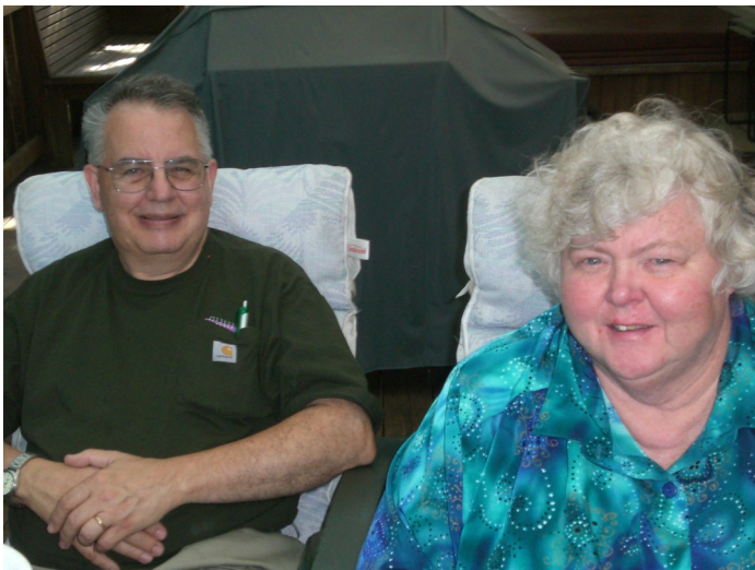
July Picnic Pictures