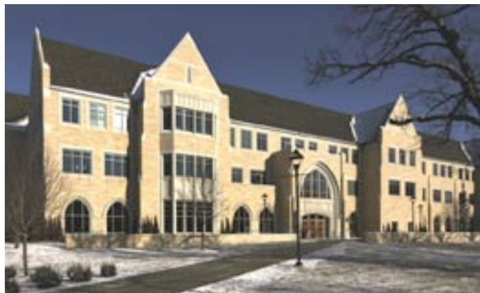
Photo of Anderson Student Center, St. Thomas University

Online registration is available at http://www.regonline.com/2012spillsym You can also go to www.mngts.org/petroleum and find Symposium information there. The GTS online registration system allows for group registrations from the same organization, payment via all major credit cards and provides an immediate registration confirmation. You may also print an invoice for future payments via check. If registering online is not an option for you, print out the paper registration form included in this brochure and return it to GTS Educational Events via mail (2233 University Avenue, Suite 150, St. Paul, MN 55114) or fax (651-223-5307).