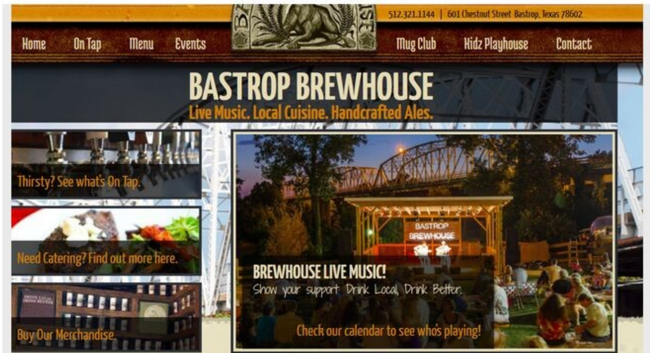
Bastrop Brewhouse website

Published: Friday, January 17, 2014, 10:39 am