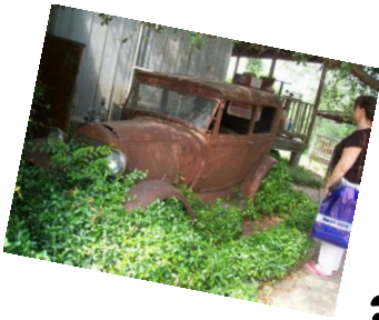
(I don't think it can be ready for the show)