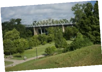
(Colorado River Bridge)