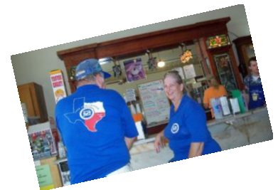
(Can't wait for a milkshake)

Total seating required for your party....._____