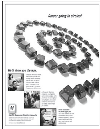
High-quality output at 1200 x 1200 dpi for crisp clear output

Backed by industry-leading service and support – B6250 Series printers come with a 1-Year On-Site warranty that can be increased up to 3 years with options. And for live technical support 24/7/365, you can call, toll-free, 800.OKI.DATA (800.654.3282) and speak to an expert located in North America. 4