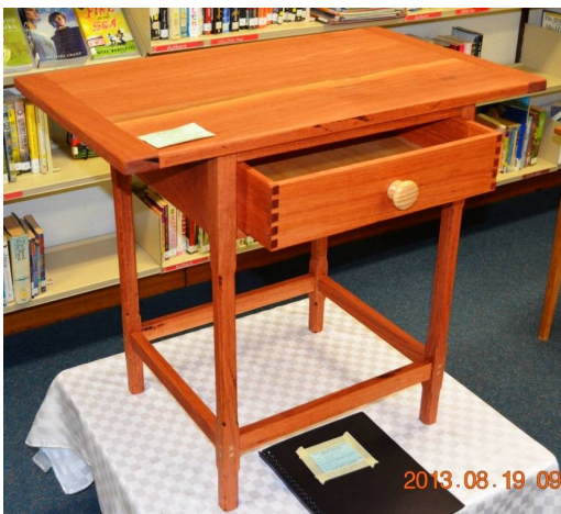
John Mangar - side table