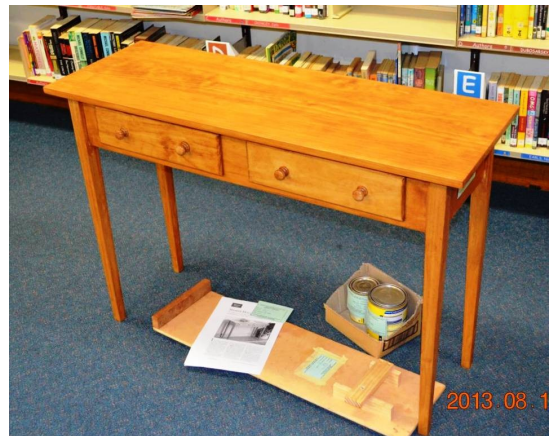
Jared Roberts - side table