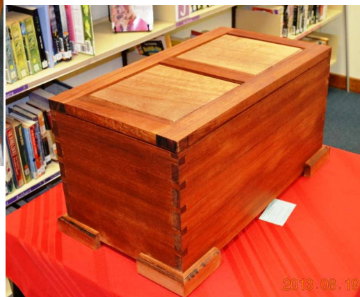
Dean Cook - tool chest