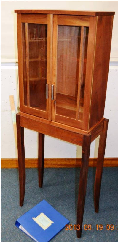
Alex Beedie - Red cedar display cabinet