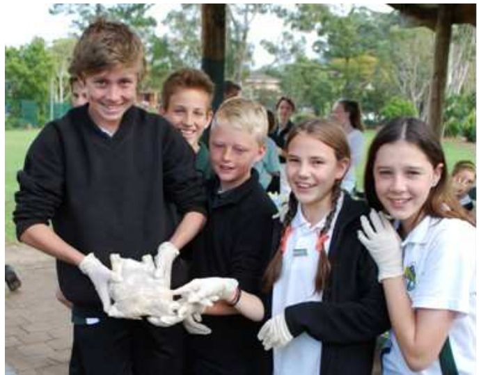
Students prepare their chicken for mummification.

It is now Week 11 and the process still hasn’t been finished. We have only just changed the salt again and are eagerly anticipating the time when we can wrap our chicken up, place spices in the wrappings and decorate the sarcophagus for the chicken to rest in eternally. Miss Harrison thinks that it will take a longer time than the usual 90 days for a body in Ancient Egypt because it is a different climate to the dry heat of Egypt. We can’t wait to see the results!