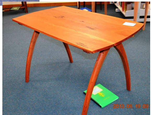
James Mangar - desk