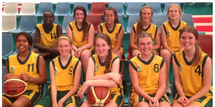
Orara High U15 Girls Basketball Team played strong.