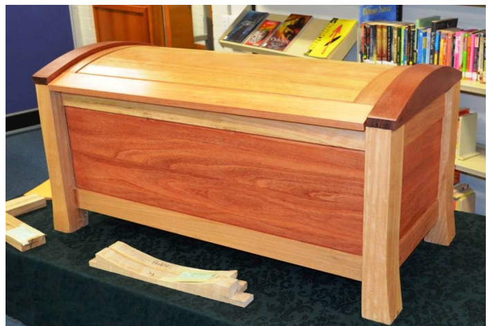
McKinlay Pearce - blanket box