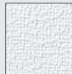
WHITE ASTRA AST-1 (LR=0.78)