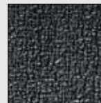
BLACK ASTRA AST-5 (LR=0.03)