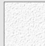
WHITE STIPPLE STP-1 (LR=0.73)