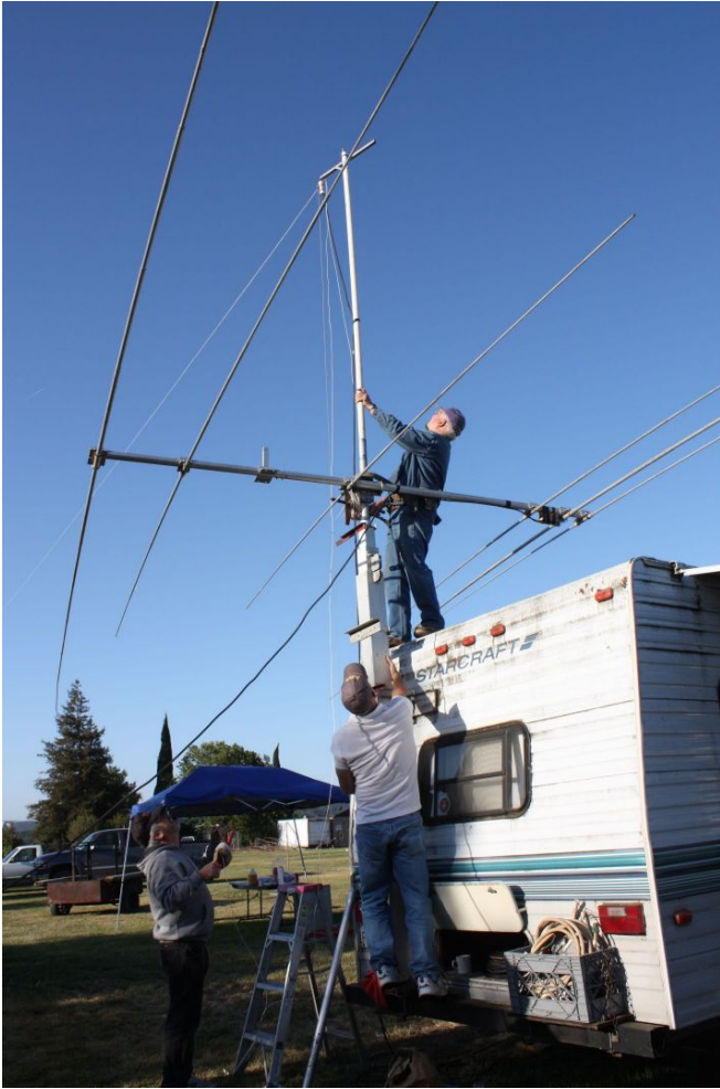
I am sure there was an easier way to do this