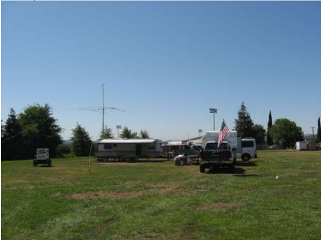
Ready to go