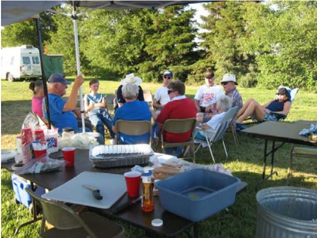
Break time and getting ready for dinner