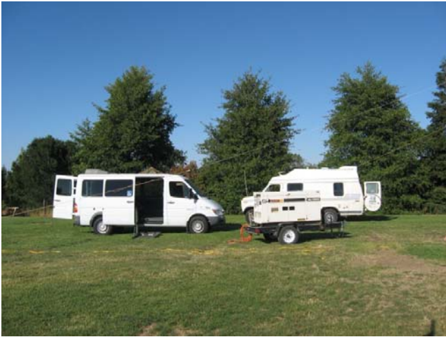
Templeton "Old Practice Field"