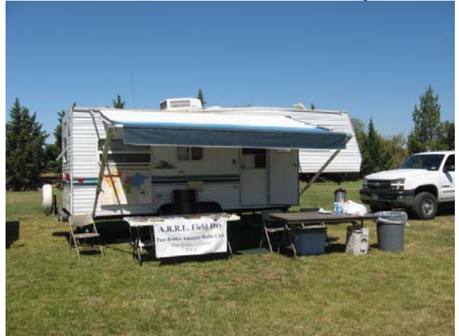
Field Day Information Station Jeff N6BST