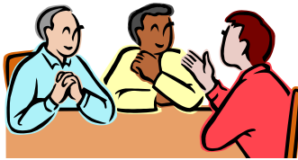
table or around a missional activity we will bear witness to the challenges of our faith as we point to our battle scars but also as we sing "Victory in Jesus."

Men of God, stay connected to God by practicing the spiritual disciplines of our faith. Gods will for us is good. We must do the rest.