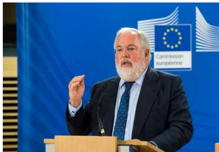
European Energy Commissioner Miguel Arias Canete visited Athens last week

Work on the project is due to get under way this year and is part of the EU strategy to reduce the region's dependence on Russia for gas supplies. Also discussed was the proposed Aegean LNG project, which would see a floating