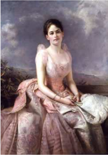
Juliette Gordon Low 1887 by Edward Hughes National Portrait Gallery at the Smithsonian

Daisy Gordon has arguably been the most significant influence on girls in the USA ever. The founder of the Girl Scouts of America, an organization which has grown from 18 girls to over 3.7 million today, Daisy and her organization has impacted more than 50 million girls, women (and even a few men) who have belonged to it.