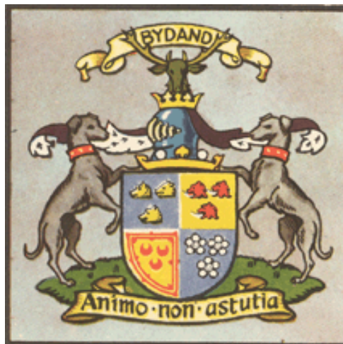
Arms of the Marquis of Huntly, Chief of the Gordons