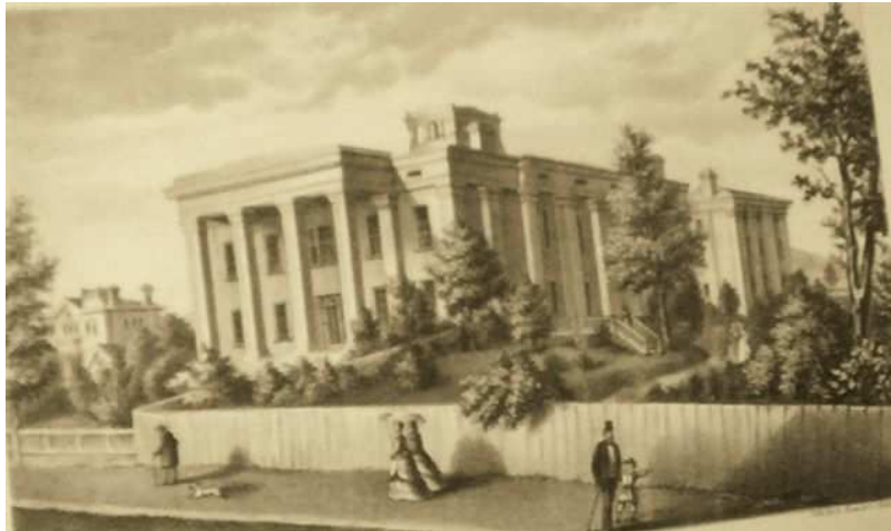
Pictured above Virginia Female Institute circa 1875, courtesy of Stuart Hall (formerly VFI) Lynchburg, Virginia