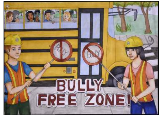
2015 Poster Contest Winner