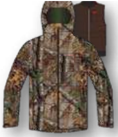
3 IN 1 JACKET, PREMIUM HUNTING JACKET WITH EXTREME VERSATILITY AND UTILITY.