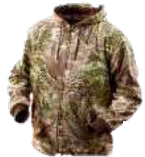
LIGHTER LAYER. PATTERN AND DESIGN IDEAL FOR GEOGRAPHIC AREAS WITH BRUSH (I.E. SOUTHWEST, TEXAS & GULF COAST)