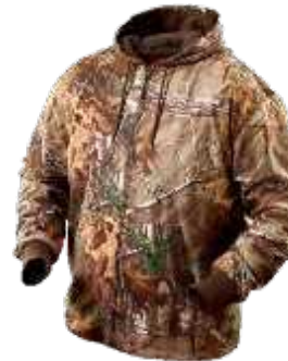
(EARLY SEASON HOODIE. LIGHTER LAYER IDEAL FOR BOW HUNTING.)

The Xtra in Realtree Xtra stands for extra effectiveness in the field. This new camo pattern blends perfectly year round in a variety of habitats. It blends best from the leaf change of fall through winter, then again in early spring before green-out. Realtree Max-1 camo lets hunters in broad terrain melt into their surroundings. Max-1 camo combines the perfect balance of neutral earth tones, prairie grasses, brush, rock, sage and open zones. Size S-3XL