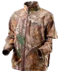
STANDARD JACKET. GREAT FOR HUNTING SEASON AND RECREATIONAL WEAR.