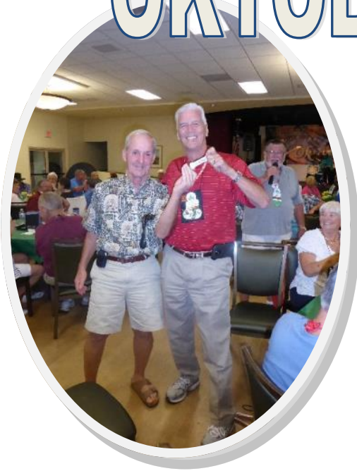
Bone Head Award