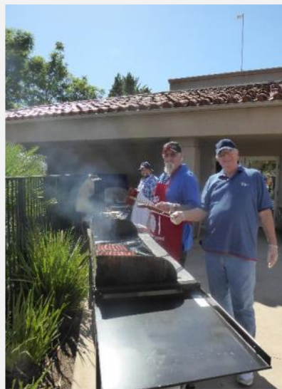
Cooking Hot Dogs