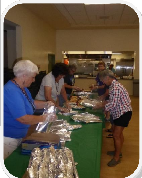
Wrapping Hot Dogs