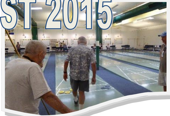
Shuffle Board Tournament