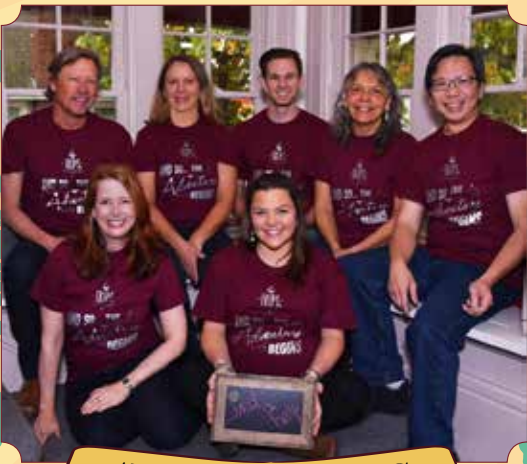
AWARD WINNING TRIPS INC.™

Every traveler will enjoy a level of quality and service that would be impossible to achieve without the experience of Trips Inc.™ staff members and their long-standing relationships with local vendors at every travel destination. So, leave the hassle of travel planning to us—there’s no one better suited to negotiate the best possible rates with airlines and hotels, and then pass those savings on to you!