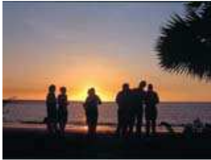
Sunset on Fannie Bay