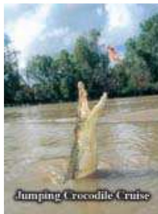
Jumping Crocodile Cruise