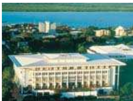
NT Legislative Assembly Building