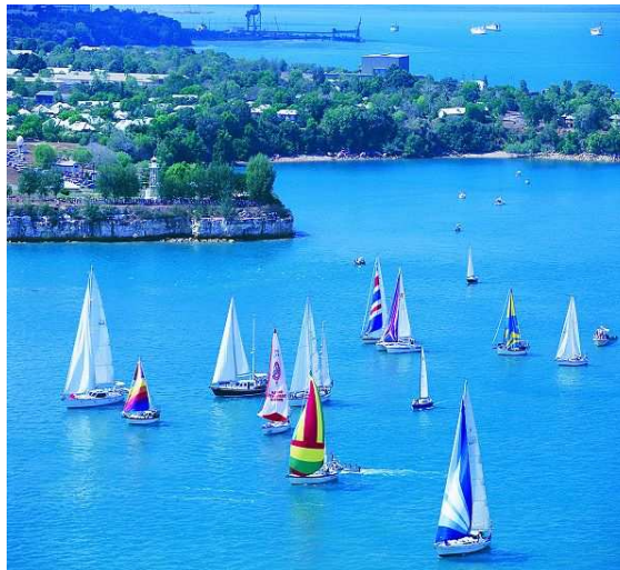
Sailing on Darwin Harbour