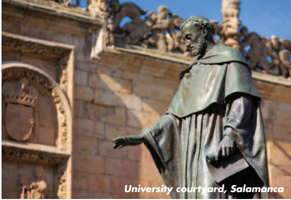
University courtyard, Salamanca