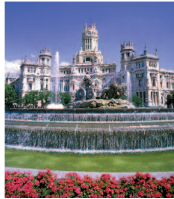
Post Office, Madrid

Spend your first and last days in Spain admiring the highlights of Madrid. From your luxurious accommodations at the Hotel Wellington, walk to Madrid's Golden Triangle of Art, located along the Paseo del Prado and comprising three world-famous museums: Prado Museum, the Museo Nacional Centro de Arte Reina Sofía and the Thyssen-Bornemisza Museum. Then take a cue from the madrileños and stroll through nearby Retiro Park, Madrid's most popular green space.