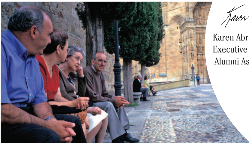
Snippets of Salamanca: University building façade | Libreros Street | Friendly locals