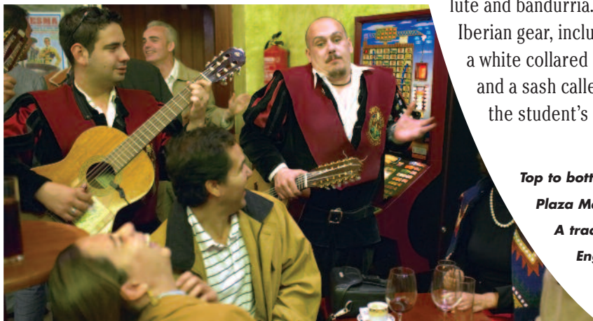
Top to bottom: Castilian-speaking Spaniards Plaza Mayor, Salamanca