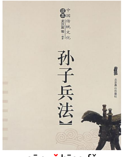
sūn zǐ bīng fǎ 孙子兵法