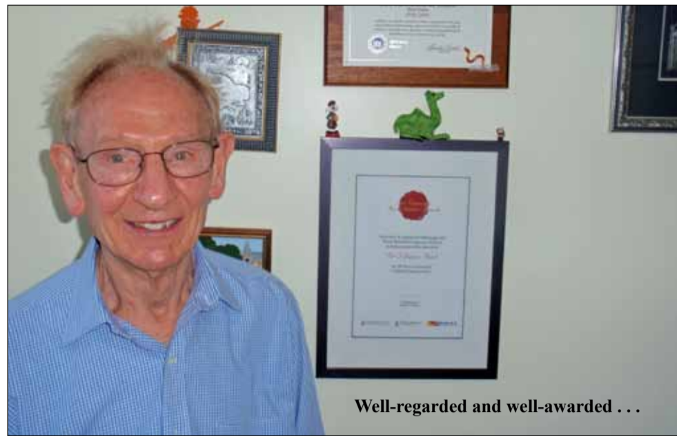
Well-regarded and well-awarded . . .

computers, three telephones and piles and piles of paper for just one doctor!