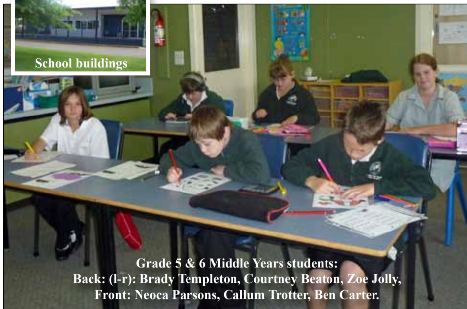
Grade 5 & 6 Middle Years students: