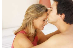
5 Best positions to get pregnant fast