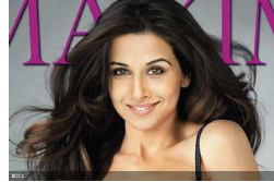
Vidya Balan in a bikini!