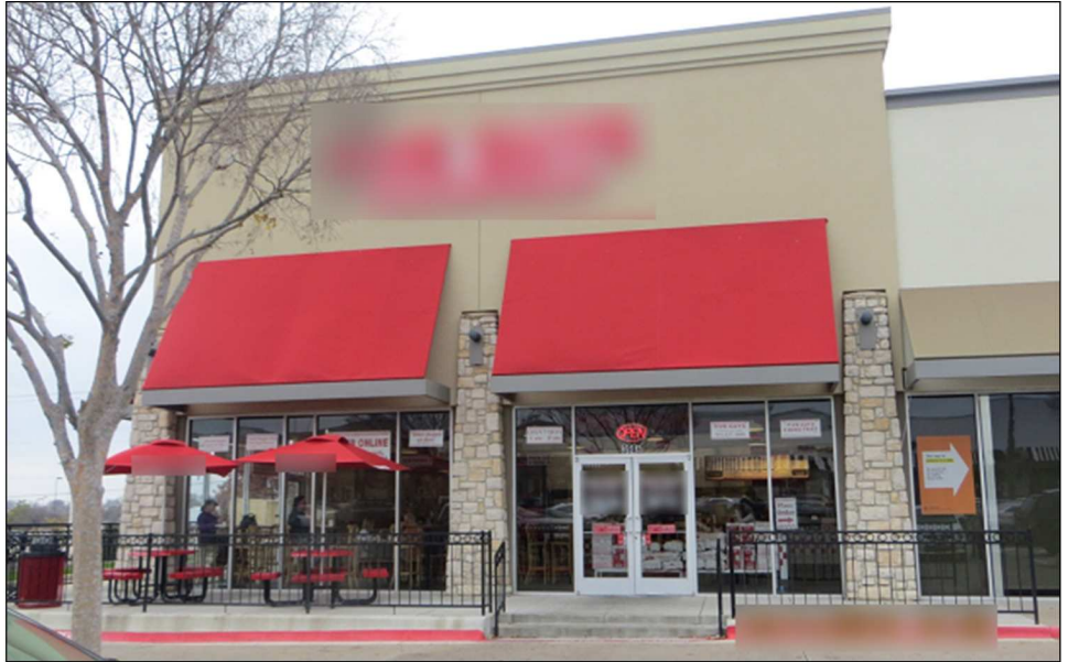
Figure 3: Fast-Food Franchise Listed as Provider's Practice Location