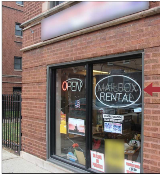
Figure 2: Mailbox Rental Store with a Suite Number Address Used as a Provider Practice Location

Provider listed this mailbox-rental store as its practice location