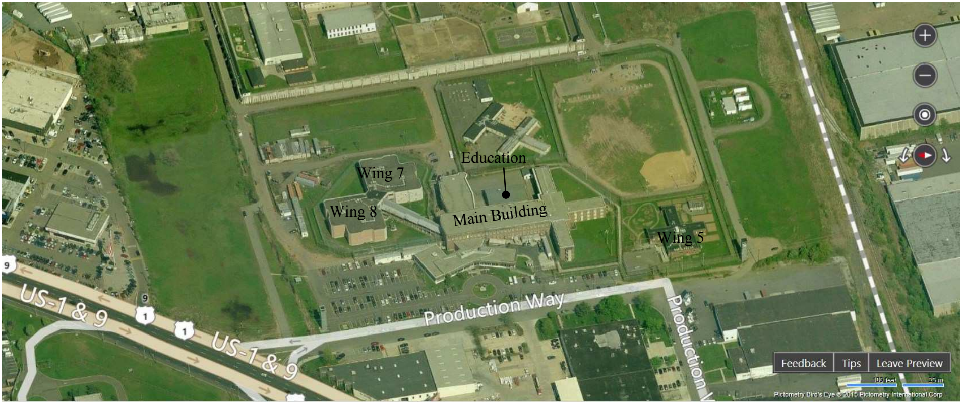
ADTC Overhead View EXHIBIT 'C'