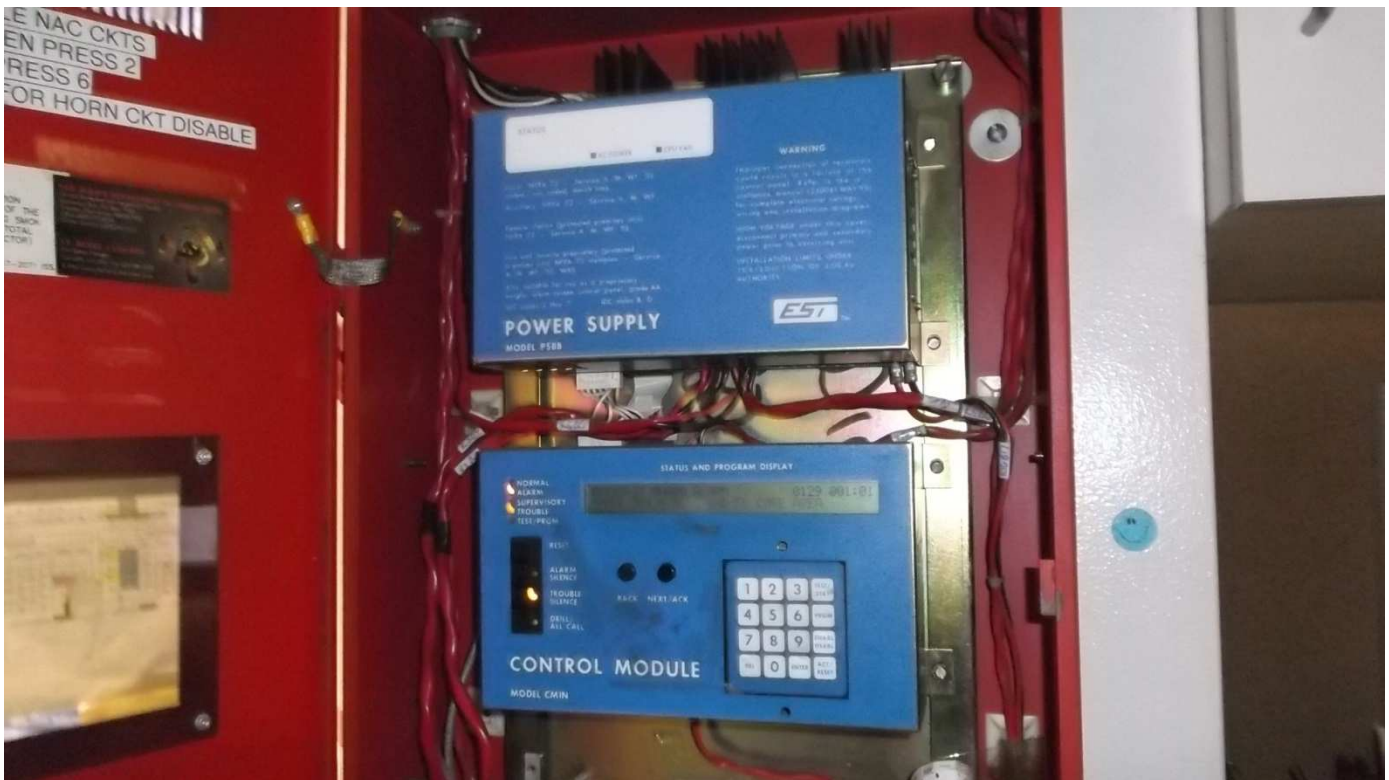
Main EST Fire Alarm Control Panel in Main Building Center Control.