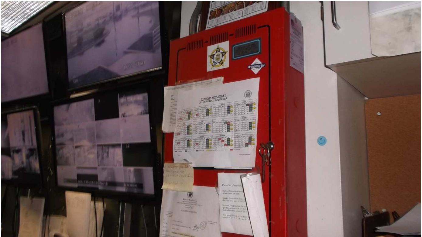
Main EST Fire Alarm Control Panel in Main Building Center Control.