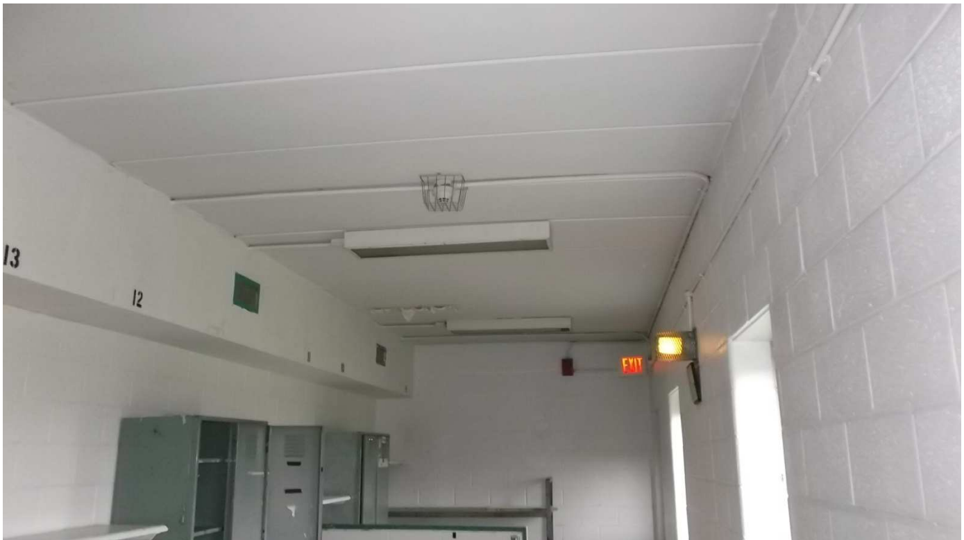
Typical device and existing conduit in sleeping area of Wing 5.