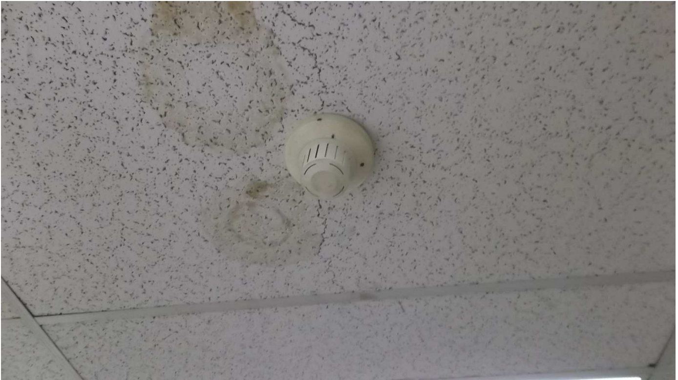
Typical smoke detector in Main Building.