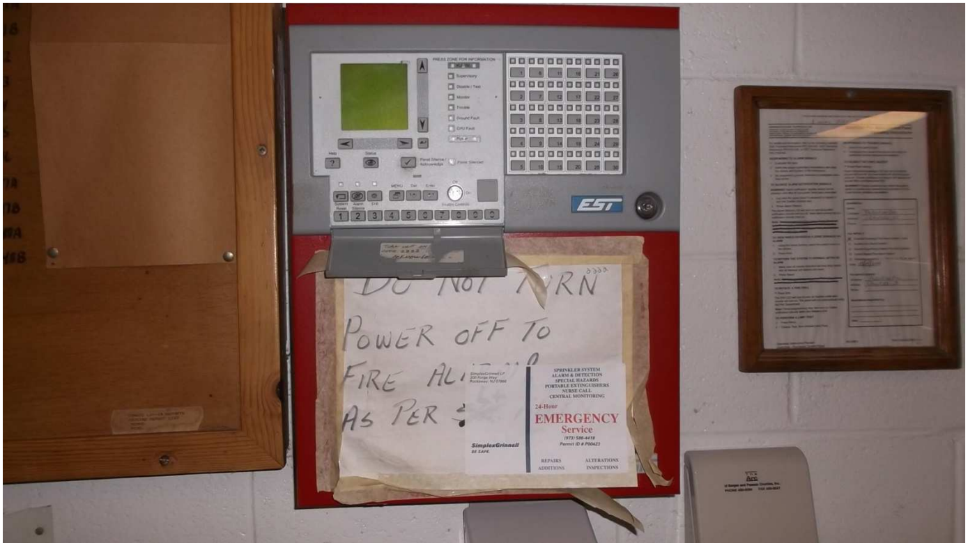
Wing 5 EST Fire Panel.