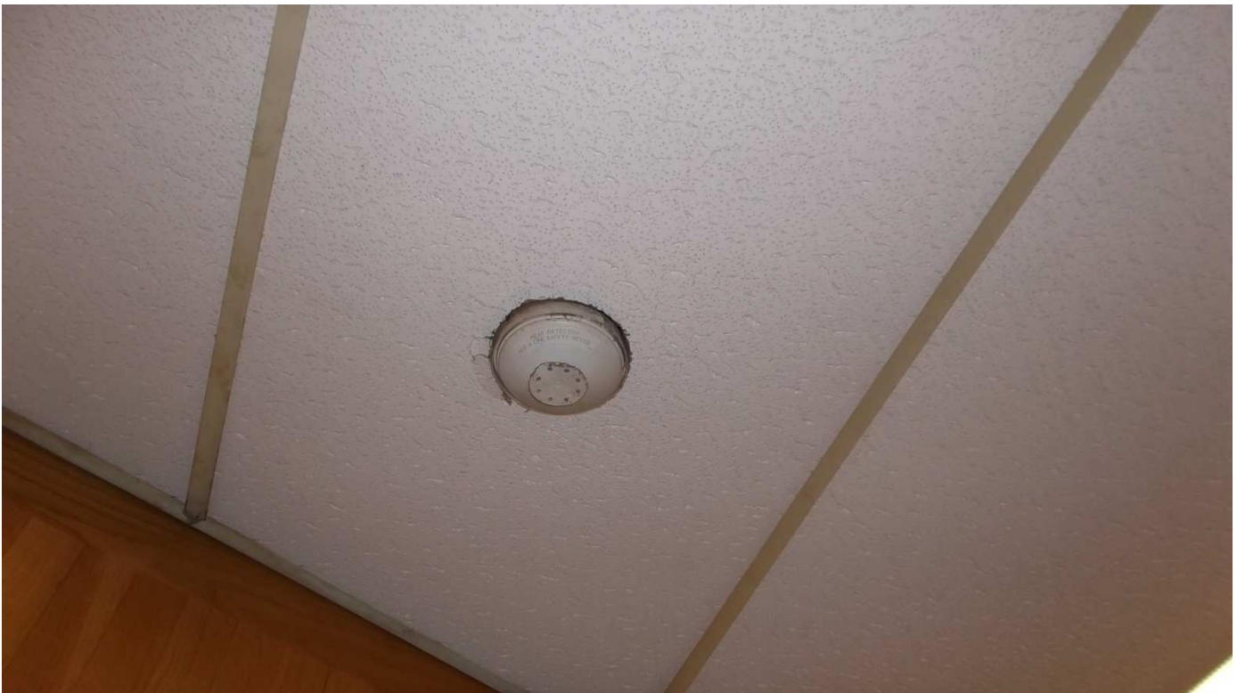
Typical heat detector in Main Building.