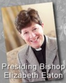
Presiding Bishop Elizabeth Eaton