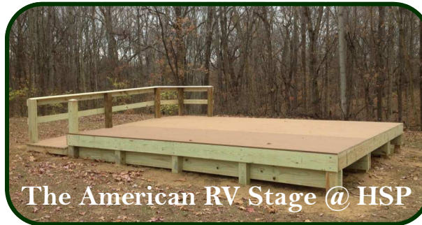
The American RV Stage @ HSP

The FHSP have been hard at work this inaugural year and have several projects we have undertaken. Improved Bluebird Trails and Playgrounds, the reinstatement of the Luau, the COMPLETED American RV Stage—the FHSP are just getting started! Check out some of these great projects and help us continue to improve this place we love!