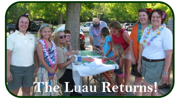
The Luau Returns!

The FHSP made updates to the Bluebird Trail at HSP. Over 10 volunteers installed and routinely check over 25 boxes. We hope to continue to grow the Bluebird Trail @ HSP!