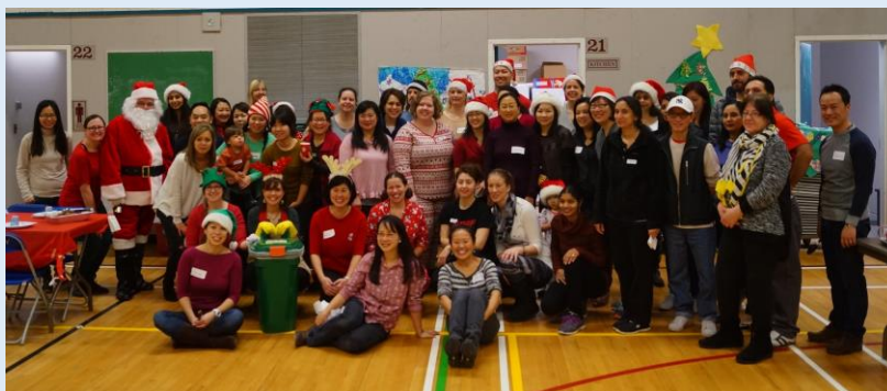
A Great Big Thank you to all the Santa Breakfast Volunteers!

Check out Volunteer Spot to find out how you can help or email pacvolunteer.montecito@gmail.com