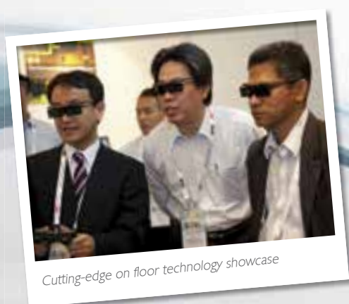
Cutting-edge on floor technology showcase

“Good opportunity to meet vendors for equipment, technology and services!”