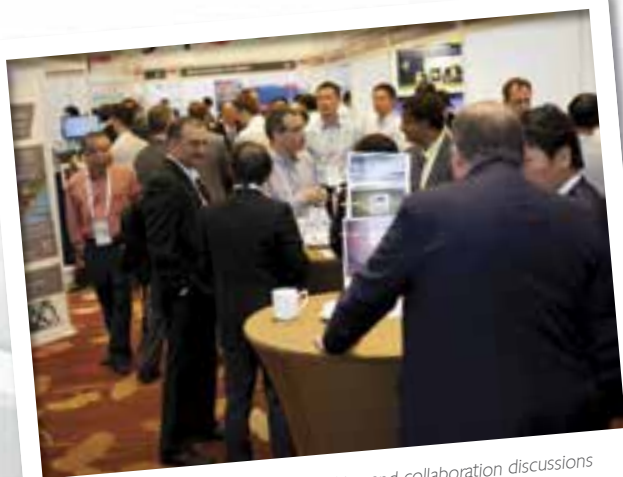
Busy exhibition floor: where networking and collaboration discussions take place

“Interesting topics presented and good opportunity for networking.”