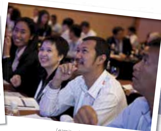
Learning about key industry developments