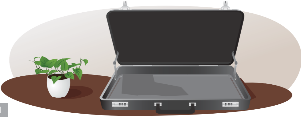
Figure 1. Annual Travel and Miscellaneous Expenses