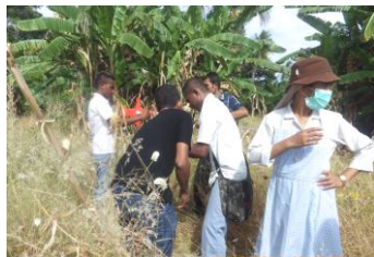
Clearing the land