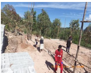
Building the Convent