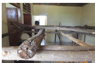
Building the clinic