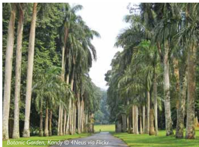
Botanic Garden, Kandy