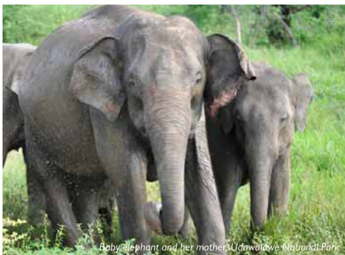
Baby elephant and her mother, Udawalawe National Park