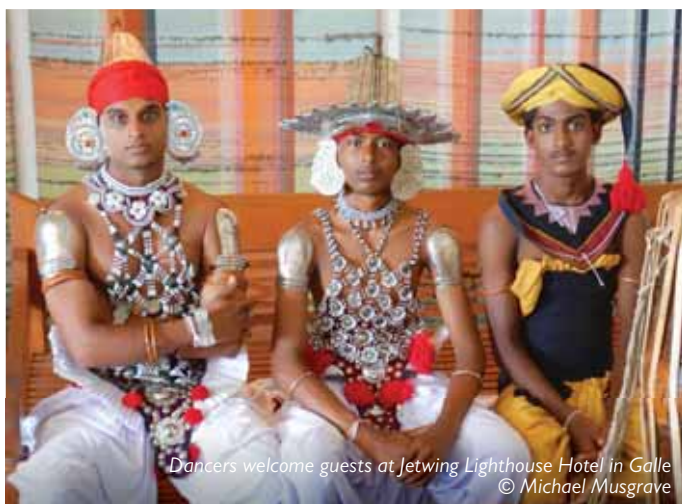
Dancers welcome guests at Jetwing Lighthouse Hotel in Galle

You can find the full terms & conditions at www.renaissance-tours.com.au/booking-conditions or we would be happy to post you a copy on request.