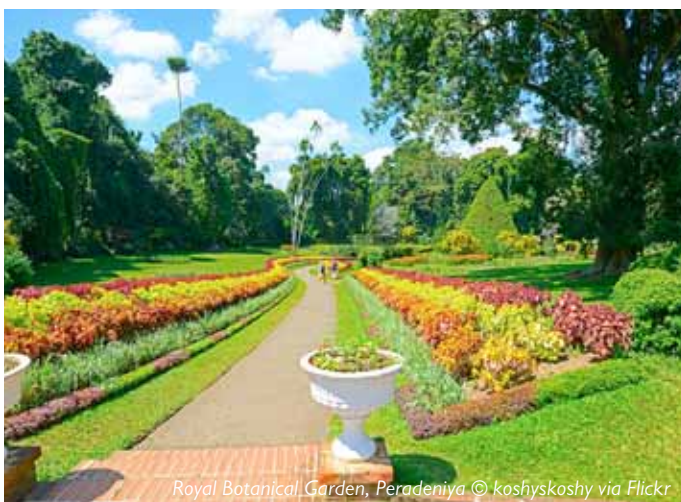
Royal Botanical Garden, Peradeniya