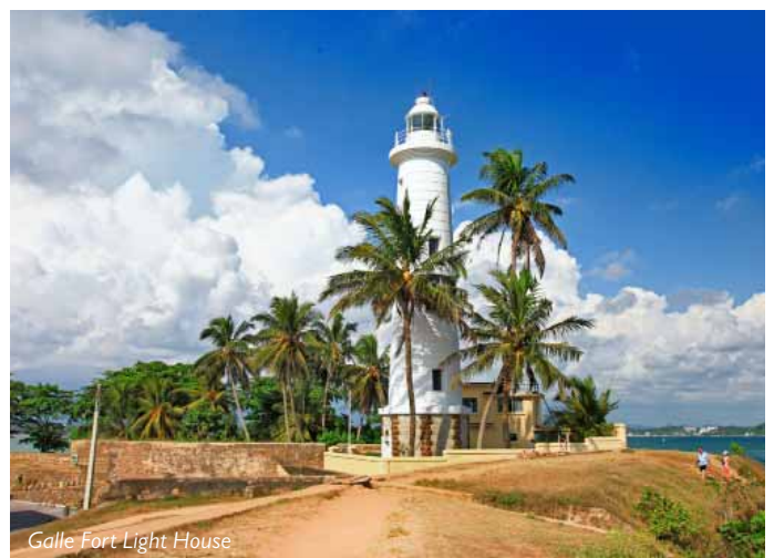
Galle Fort Light House