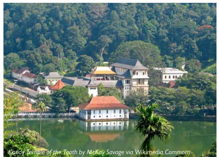
Kandy Temple of the Tooth