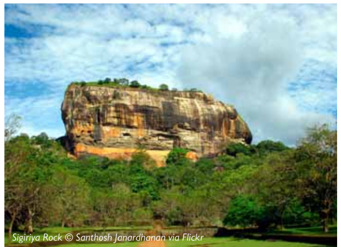
Sigiriya Rock