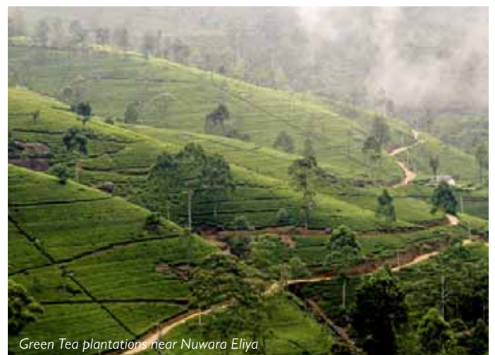
Green Tea plantations near Nuwara Eliya

After lunch at Lunuganga, return to Galle. Afternoon at leisure to explore Galle Fort. B L