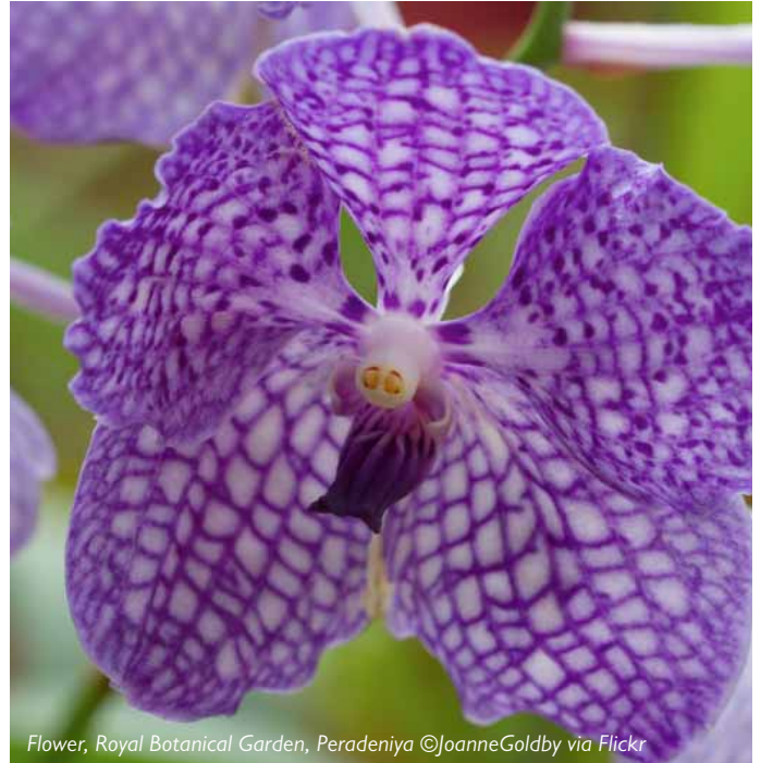
Flower, Royal Botanical Garden, Peradeniya

1.30 am departure from Colombo on Singapore Airlines to Singapore and Australia. Evening arrival in Australia.