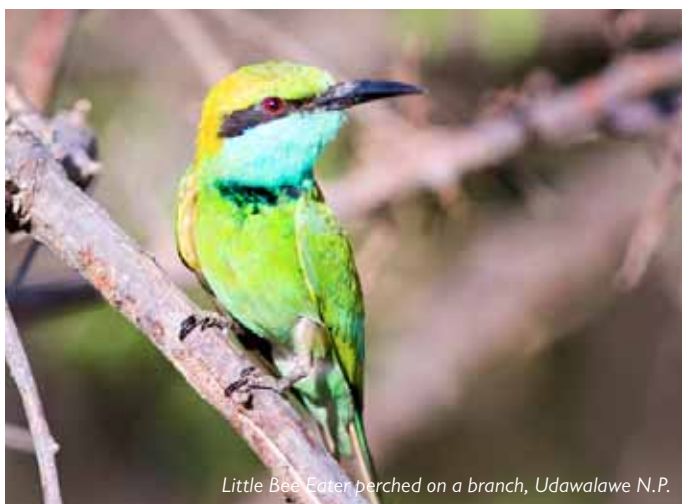
Little Bee Eater perched on a branch, Udawalawe N.P.

In the afternoon, visit Hakgala Botanical Gardens which were established in 1861 under the patronage of the British. They are located under the Hakgala Peak and are the highest set botanical gardens in the world. There are trees like English Oak, Himalayan Pines, Japanese Cedars and Cypress trees from California. B L D