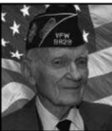
Forrest Barker Post 9829 Payson