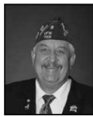
Dennis Dole Post 769 Quartzsite