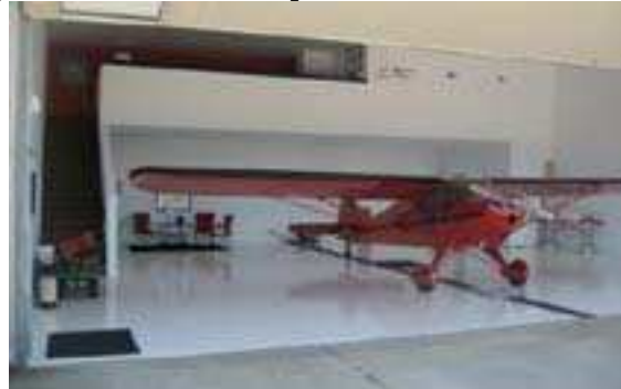
Interior with custom loft

Beginning the spring of 2015, we are building to the south of our existing complex with 2 exciting options. We have implemented new codes and added amazing details such as garage doors, additional storage and windows, creating a well-thought out hangar that is completely versatile.