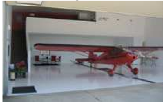
Interior with custom loft

Beginning the spring of 2015, we are building to the south of our existing complex with 2 exciting options. We have implemented new codes and added amazing details such as garage doors, additional storage and windows, creating a well-thought out hangar that is completely versatile.