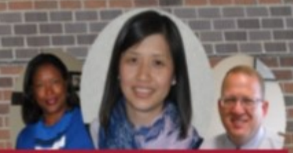
Anthony Admin Team

International Baccalaureate School 5757 Irving Ave S. Minneapolis, MN 55419 anthony.mpls.k12.mn.us Phone: 612-668-3240 Fax: 612-668-3250 Attendance: 612-668-3271