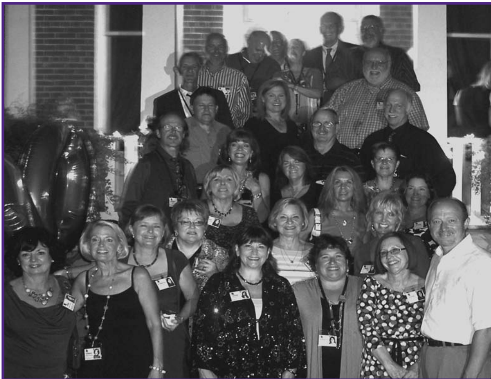
Class of 1970