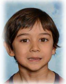
Murray Pre Prim - Rm 9.1