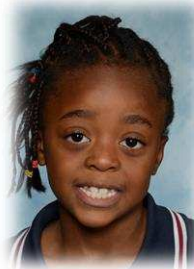
Faith Yr 1 - Rm 6.1