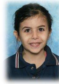
Harmony Yr 3 - Rm 6.5