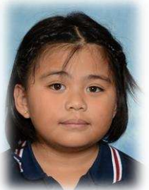
Ayl Shiraz Yr 2 - Rm 6.4