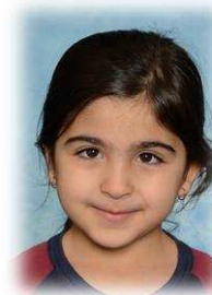
Noor Pre Prim - Rm 9.2