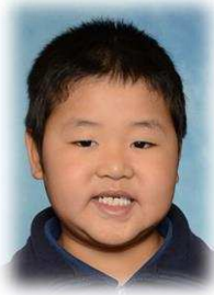
Jadan Yr 1 - Rm 6.2