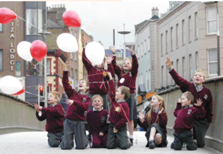
Children from the Traveller Community let their wish balloons fly, on behalf of the Irish Traveller Movement (ITM), to mark International Human Rights Day, Millennium Bridge, Dublin in 2004

“Ireland in recent years has experienced modest population growth, immigration overtaking emigration, dramatic and sustained levels of economic growth, persistent poverty and widening of inequality. Ireland's health and social indicators reveal a dismal picture, and the level of investment in public services is low. ... Ireland's record on civil rights, human rights and related issues falls far short of international human rights standards.”