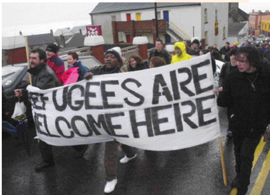
Tramore Pro-Refugee Group protest march.

Translation and special needs: Where significant minority language groups exist, translation should be undertaken. Similarly, attention should be given to ensuring that citizens with special communication needs are taken into account, for example people with disabilities or