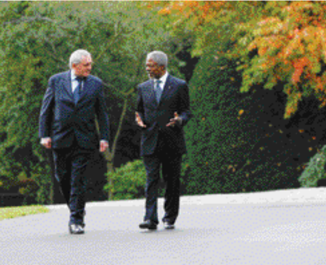
United Nations Secretary General Kofi Annan with An Taoiseach Bertie Ahern TD in the grounds of Farmleigh House, Dublin.

The express application of the human rights framework goes beyond citing a particular human right or treaty and necessitates recognition of the inter-related and interdependent nature of human rights. The illustration of the right to health below highlights this inter-relationship and interdependence. As part of the UN system, the WHO recognises the human rights basis of its work. The following diagram (adapted from WHO materials) illustrates the legal principle that all human rights are interdependent. In particular, it notes the connection between human rights traditionally classified as civil or political (e.g. right to information, right to privacy, right to participation) and socio-economic rights (e.g. the right to health).