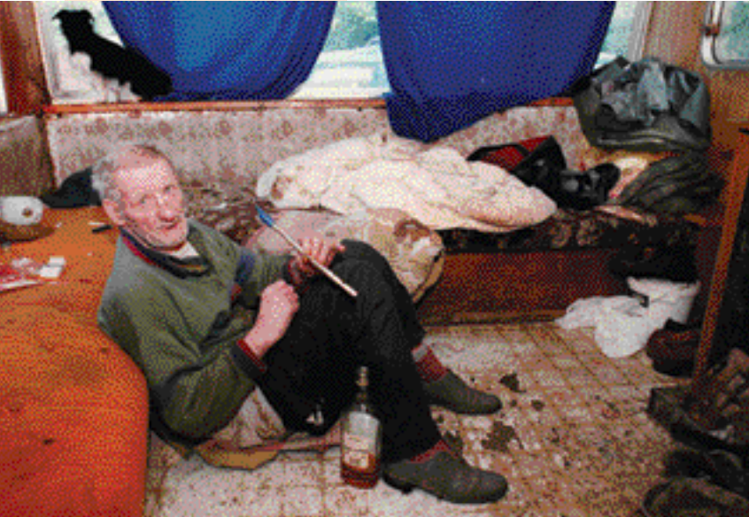
An elderly Traveller, living in appalling conditions in Tallaght

Consultation and coordination within Government are also crucial. The involvement of a wide range of government agencies in developing and implementing the plan will reinforce the notion that human rights are not just a matter for justice or foreign affairs ministries, but are the responsibility of Government as a whole. Commitment by public officials to the plan is vital to ensure that required human and financial resources are allocated.