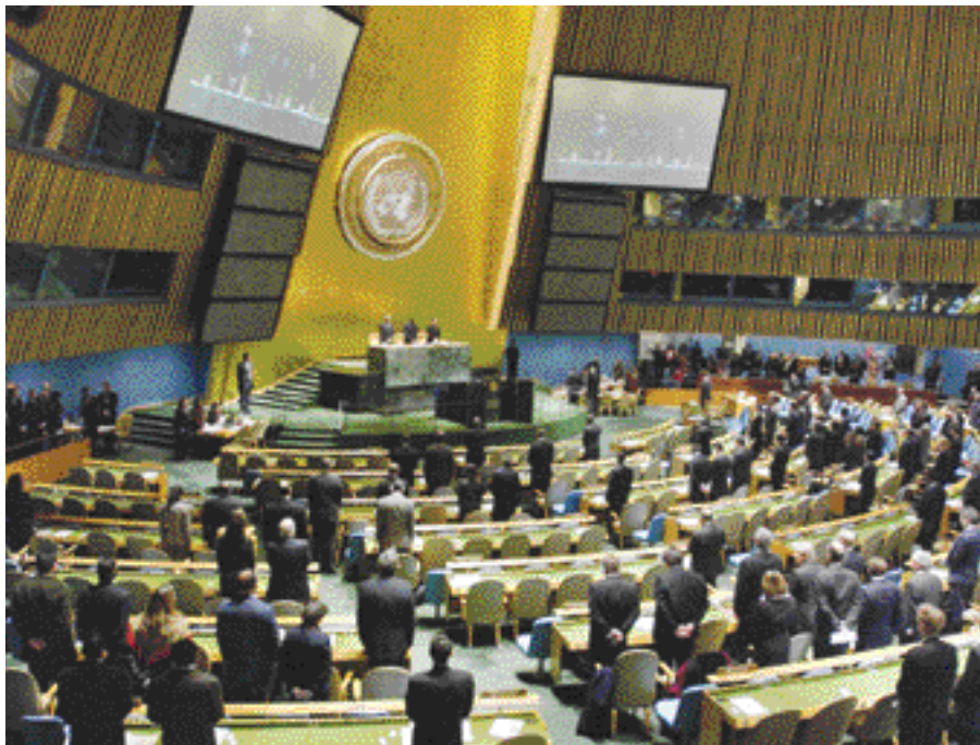
UN General Assembly observes a minute of silence in commemoration of the 60th Anniversary of the Liberation of the Nazi Concentration Camps on 24th January 2005.

Care International www.kcenter.com/phls/rba.htm