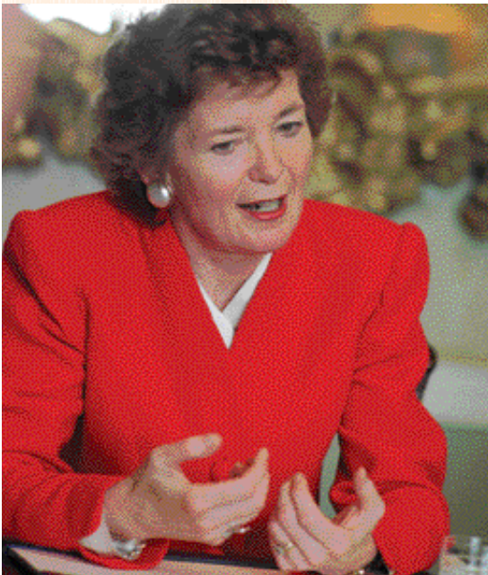
Former Irish President and UN High Commissioner for Human Rights, Mary Robinson.