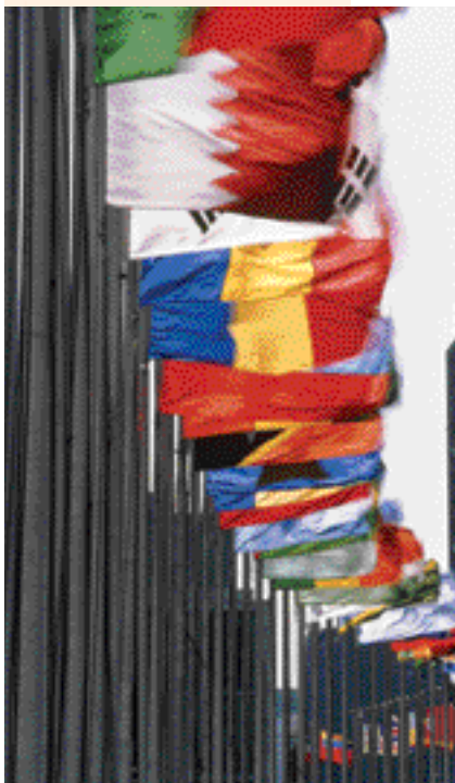
The flags of the member states outside the United Nations Headquarters in New York.