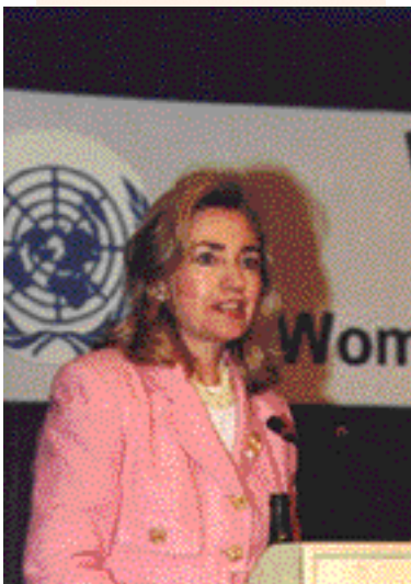
Hilary Rodham Clinton speaking at the Fourth World Conference on Women in Beijing in 1995.

A lack of coherence is evident in official descriptions of the nature of NAPS. The 2000 State report under the Covenant on Economic, Social and Cultural Rights describes NAPS as being intended to “implement the United Nations commitment to substantially reduce overall poverty and inequality”. 102 However, at the same time, the report describes NAPS as merely an “administrative document” outlining “principles” and “aims”, providing a “broad strategic direction”. That NAPS is only a strategy statement as opposed to a legal document, is then cited