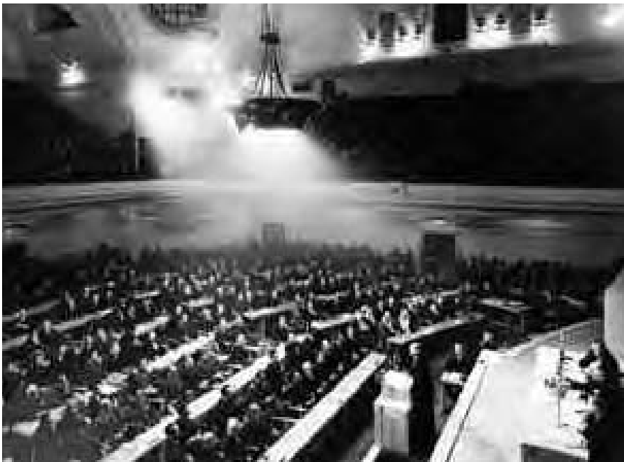
United Kingdom Prime Minister Atlee addresses the first meeting of the UN General Assembly, London on 10th January 1946

UN Human Rights Strengthening Programme, Review 2001