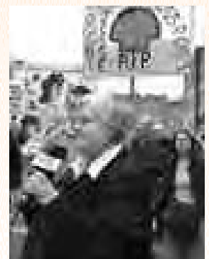
Protesters highlight the connection between issues in Ireland and developing countries.