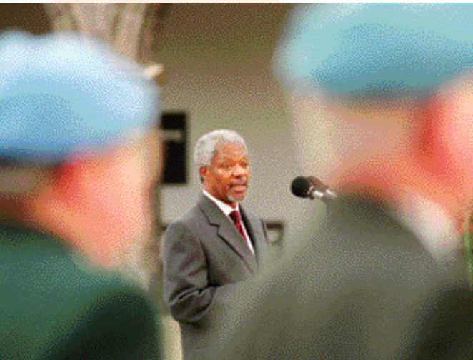
The Secretary General of the United Nations, Kofi Annan, at a wreath laying ceremony at the Royal Hospital Kilmainham, Dublin, to commemorate Irish Peacekeepers who have given their lives in the cause of peace.

After independence, this commitment was expressed on the international stage by Ireland's active engagement with core human rights mechanisms. As early as 1923, the new State joined the International Labour Organization (ILO) 52 and, since then, Ireland has ratified seventy-three of its treaties – including its eight core human rights conventions on issues including forced labour, freedom of association, protection of the right to organise, collective bargaining, equal remuneration, discrimination in employment, minimum age and the worst forms of child labour.