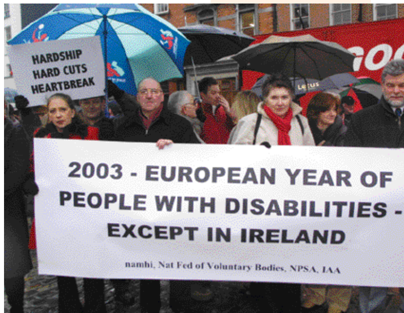
Protesters outside Namhi Disability conference in Dublin.