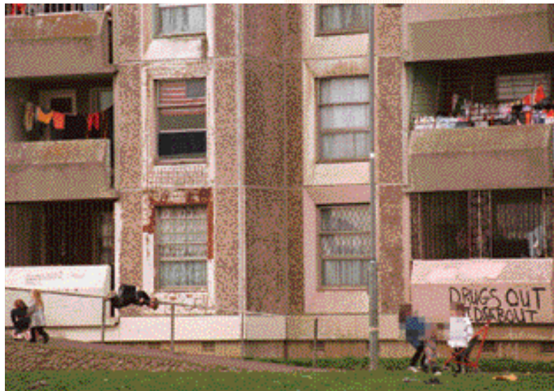
Children playing in Ballymun.