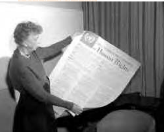
Eleanor Roosevelt holding a copy of the Universal Declaration of Human Rights, drafted and approved by the UN Human Rights Commission under her chairmanship.

The equal status of all human rights was reaffirmed in 1993, when 170 states, including Ireland, reached consensus at the World Conference on Human Rights in Vienna. 3 The Vienna Declaration and Programme of Action 4 re-stated the legal principles that all internationally recognised human rights are universal, inalienable, interrelated and interdependent. The universality of human rights means that they are to be enjoyed by everyone, without discrimination, throughout the world. Their inalienability means that they are inherent in each