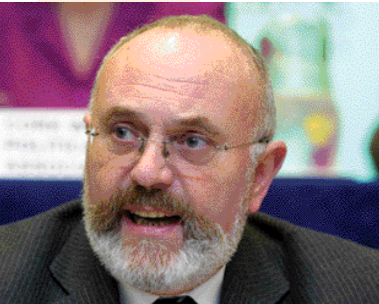
Senator David Norris, who successfully challenged Irish law criminalising homosexuality in the European Court of Human Rights in Strasbourg.

However, it is notable that external factors have been vital in stimulating human rights change in Ireland. Much social progress is linked to requirements arising from European Community law such as the revised National Anti-poverty Strategy; incorporation of the ECHR and the recent establishment of the Irish Human Rights Commission derive from the Good Friday Agreement; a range of civil and political rights have been the result of individuals being forced to engage in protracted litigation before the European Court of Human Rights in Strasbourg. 62 But, while the Human Rights Commission has published extensive conclusions outlining non-compliance with human rights standards in legislative proposals, 63 and the Equality Authority