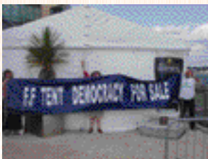
Protestors outside the Fianna Fáil hospitality tent at the Galway races in June 2005.

CORI Justice Commission, Priorities for Fairness, 2004