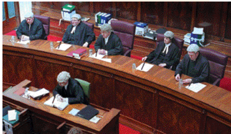
The Supreme Court sitting in Dublin in 1997

Ireland is a party to six of what are sometimes called the "big seven" UN human rights treaties. The exception is the Convention on the Protection of the Rights of All Migrant Workers and Members of Their Families, which is of particular relevance to a growing minority in Ireland. On his appointment as advisor to the UN Secretary General on UN reform, the current Minister for Foreign Affairs, Dermot Ahern, described Ireland as "a small nation with a good history of adherence to UN process". This is at least partly true. But, an example of Ireland's not fully adhering to the UN process is that eight of the twenty-five treaties (i.e. treaties supplementary to the "big seven") identified by the UN Secretary General at the Millennium Summit in 2000 as representative of the UN's key objectives, have yet to be ratified by Ireland.