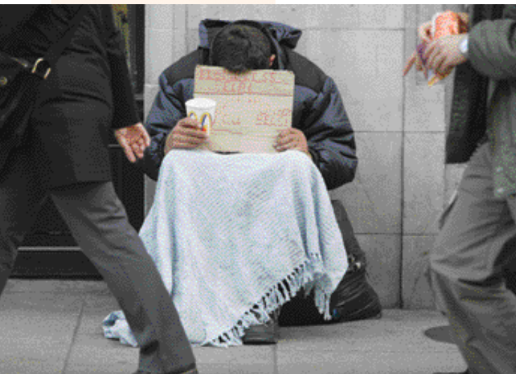
Homeless, and faceless