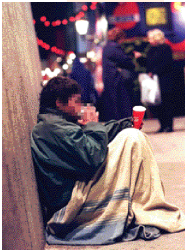
A young homeless man in the centre of Dublin.

1993 Vienna Declaration and Programme of Action agreed by Ireland and 170 other states