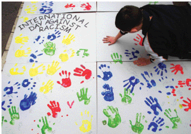
A painted handprint is added to posters in support of United Nations International Day Against Racism in Grafton Street, Dublin, 2000.

A major challenge to advancing HRBA is the failure to use human rights language where appropriate. This is in part due to lack of literacy in terms of the human rights framework, with specialists from other disciplines creating new terms for concepts that are already outlined in international legal standards. Examples include the use of terms such as good governance, democracy and rule of law as somehow distinct goals, independent of human rights, when in reality they are composite human rights concepts. Similarly, commitments to participation, empowerment, etc., are frequently couched in language which avoids any linkage to these concepts as matters of international law and legal accountability. Any suggestion that participation can be achieved without applying HRBA misses the essential importance of the HRBA concept itself. Participation premised on recognition of "beneficiaries" as bearers of human rights is to be distinguished from other kinds of participation (e.g. participation motivated by need for political or other legitimisation) in that it empowers and maximises the