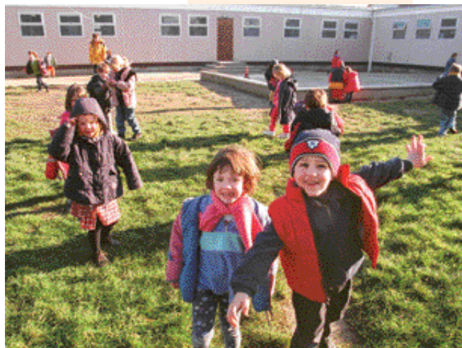
Children playing during break at Monkstown Educate Together National School

Post Polio Support Group submission, Report of the Commission on the Status of People with Disabilities (1996)