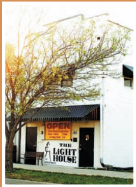
The Lighthouse Ministries' current facility on Elm Tree Lane opened in 1997. It is now filled beyond capacity at each meal, with need growing daily.

In the early 1990's, Dan and Tay Henderson began their ministry program at The Salvation Army. Before long, they opened The Lighthouse Ministries, Inc. in downtown Lexington where they ministered to the homeless, poor, and addicted until 2004 when God called Dan home. Tay continues on with the vision today.