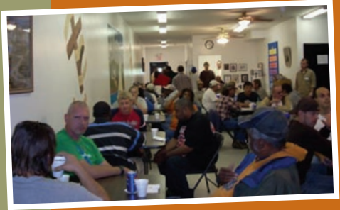
Lunchtime at The Lighthouse.

The Lighthouse Ministries, Inc. is a non-profit Christ-centered organization designed to meet the physical and spiritual needs of those in crisis situations.