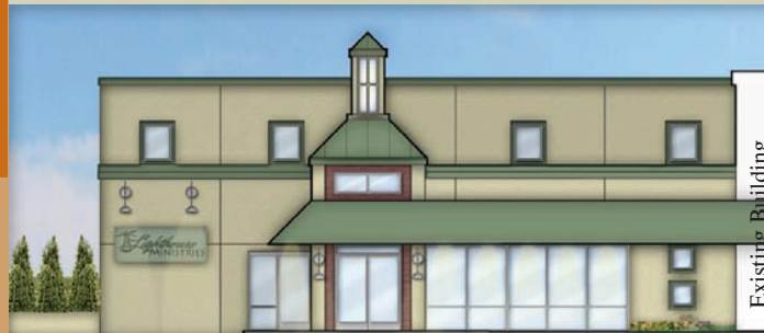
Architect's rendering of the new 6,000 s.f. building.