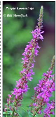
Purple Loosestrife

Like us on facebook! (Paid Advertisement)