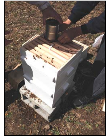
Right Pkg. installed with queen cage & feeder can added.