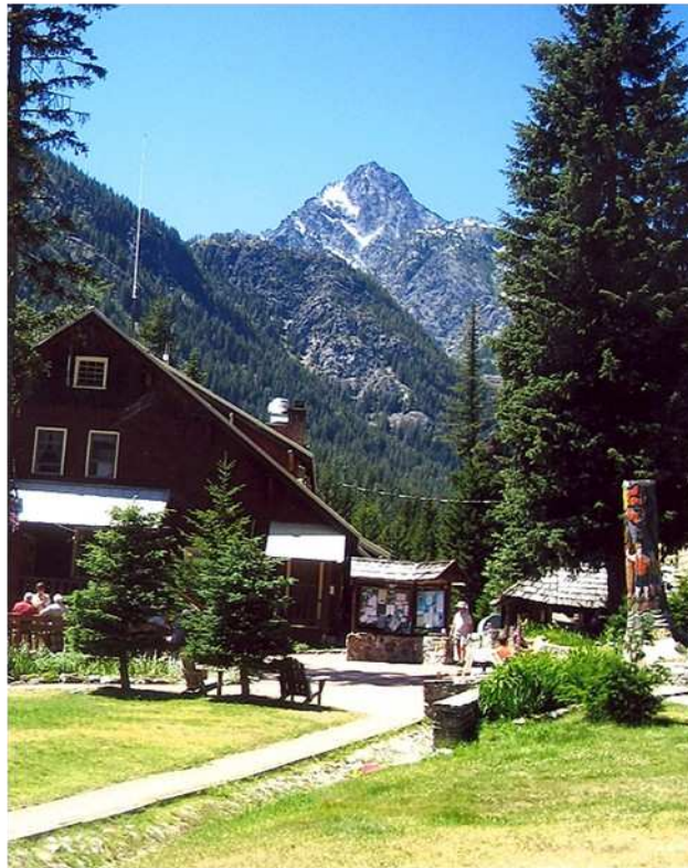
The Holden Village, Chelan, WA