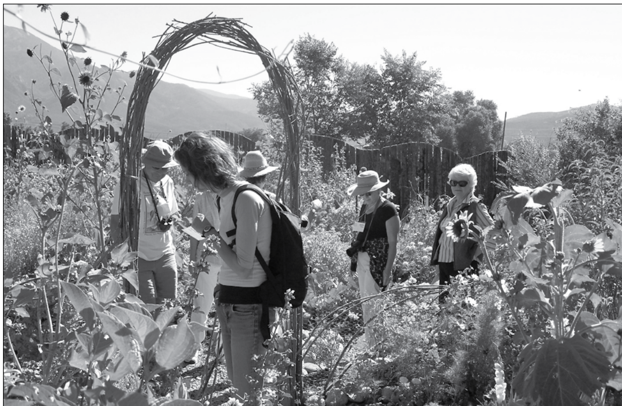
Annual Meeting attendees enjoy a beautiful Taos garden, the second stop on their tour. See article, p. 3.