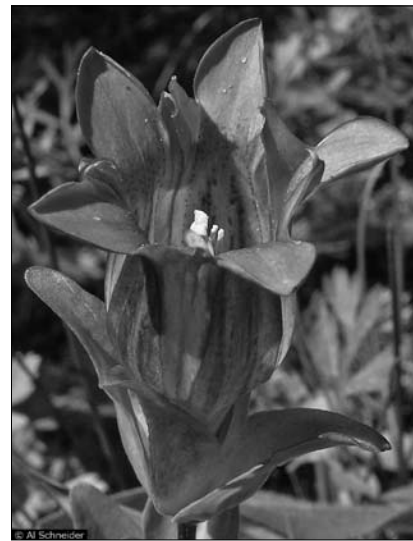
A gorgeous native, Gentiana parryi : One of the rewards of the hike to Williams Lake (see article, page 5).

It is up to those of us who care to stop the invasion. The people who agree with Emerson, the complacent and the apathetic, will not. Let's get with the program! ❖