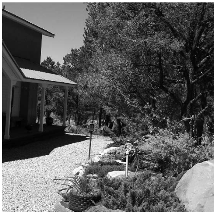
Third and last stop on the Annual Meeting garden tour. Another example of beautiful native-plant landscaping (see article, page 3).

Membership in the NPSNM is open to anyone supporting our goals of promoting a greater appreciation of native plants and their environment and the preservation of endangered species. We encourage the use of suitable native plants in landscaping to preserve our state's unique character and as a water conservation measure. Members benefit from chapter meetings, field trips, publications, plant and seed exchanges, and educational forums. Members also qualify for membership in New Mexico Educators Federal Credit Union. A wide selection of books dealing with plants, landscaping, and other environmental issues are available at discount prices. The Society has also produced two New Mexico wildflower posters by artist Niki Threlkeld and a cactus poster designed by Lisa Mandelkern. These can be ordered from our poster chair or book sales representative.