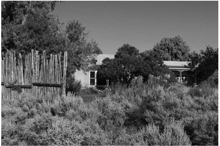
The pleasant surroundings of native shrubs at the first stop on the Taos garden tour.

The third garden was at Greg Nelson's home, at the end of a long drive up into the foothills on an unpaved road through a forest of junipers and piñon pines. We arrived at a clearing where there was an attractive and comfortable two-story house. Wildfires are a concern in such a situation, and we noticed that the outside of the house was all of fire-retardant materials, including a metal roof, and next to the house itself all the shrubs and trees were removed and replaced by a serene, Zenlike landscape of gravel and large boulders. There were a number of large planters with