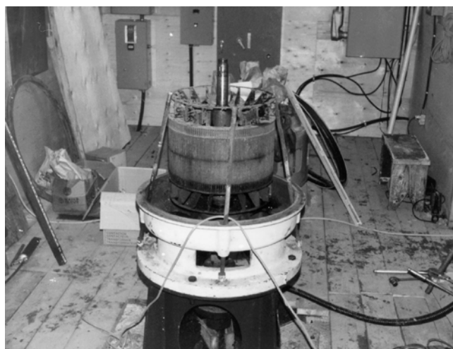
Pump disassembled for maintenance.

A copy of the local Emergency Response Plan can be inserted in section 3.7.