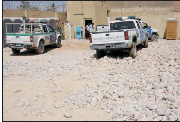
Figure 3-1. The consequences of a poorly-written PWS for a gravel parking area.