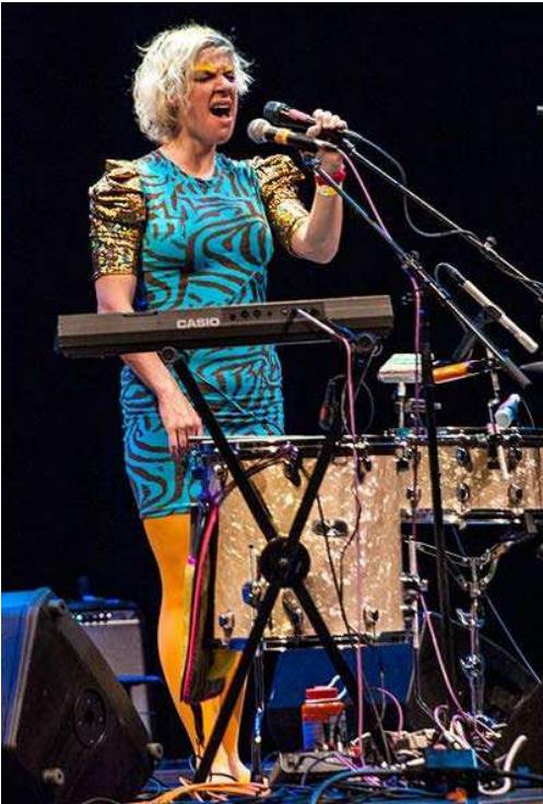
KUTX SECOND BIRTHDAY CONCERT MORE PHOTO GALLERIES »