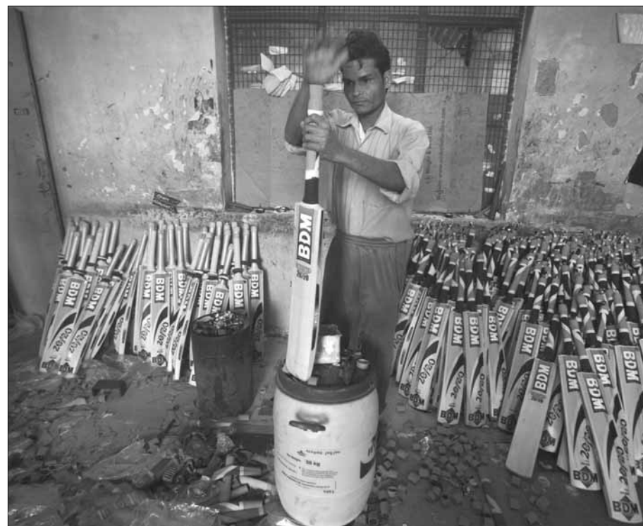
A WORKER adjusts the grip on the handle of a cricket bat at a factory in Meerut, 80 km northeast of Delhi, as cricket equipment makers race to meet a demand surge ahead of the Cricket World Cup. — Reuters

Boxes of finished bats pile up in every direction from the factory entrance, ready to be distributed across India and the world to global superstars, academy players and amateur batsmen. — Reuters