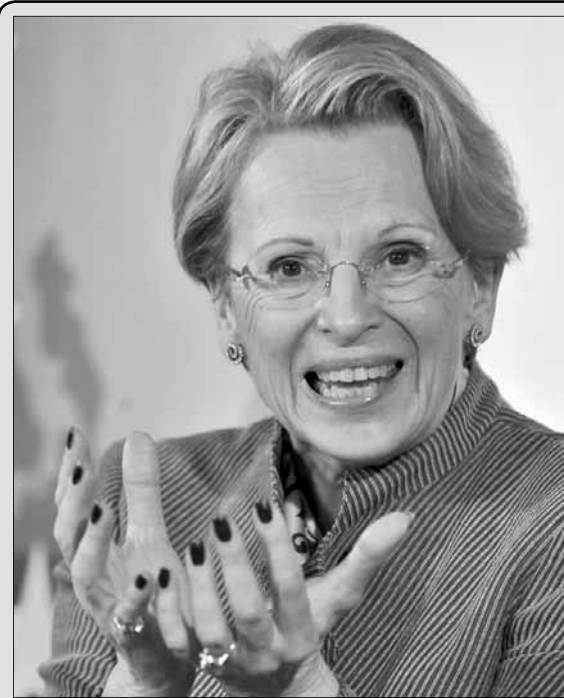
FRENCH Foreign Minister Michele Alliot-Marie during a press conference in Brussels. The minister yesterday regretted the "shock" caused by her holidaying in Tunisia during the popular uprising there but refused to resign under pressure from political opponents. She had faced calls to resign after she admitted travelling in a private plane owned by a businessman who was allegedly close to relatives of Tunisia's former leader, Zine El Abidine Ben Ali.

"The Islamic republic has the ability of blocking the Strait of Hormuz if threatened," Fadavi told Mehr news agency. — AFP