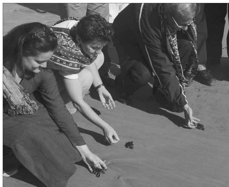
UNITED NATIONS Framework Convention on Climate Change executive secretary Christiana Figueres (C) releases green turtle hatchlings into the Arabian Sea at World Wildlife Fund turtle hatchery in Karachi yesterday. Figueres said mangrove forests prevent the damage of cyclones and sea intrusion and underlined the need for adopting appropriate measures to counter the disasters and natural calamities. — AFP

EU regulators last month approved the purchase of anti-virus software maker McAfee by the world's No. 1 chipmaker, Intel, with the requirement that Intel keep its chips compatible with other antivirus makers' products. — Reuters