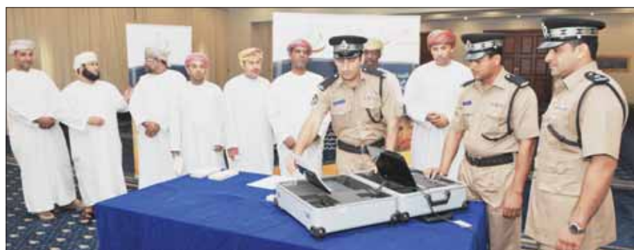
MUSCAT — The mobile electronic unit allocated for installing the electronic system at the IDs to ensure the presence of the voter during the election process of Majlis Ash'ura 7th term yesterday visited the office of Muscat Governor to install the system at the IDs of the staff.