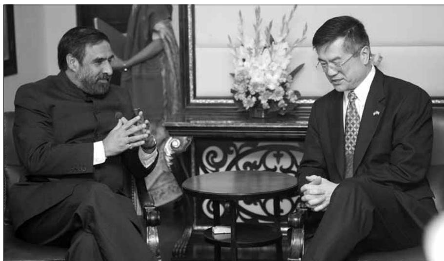
MINISTER for Commerce and Industry Anand Sharma meets with US Commerce Secretary Gary Locke in New Delhi yesterday. — AFP

State Home Minister Ravi Naik told the local legislature that the CBI has now been asked to probe the cases. Both incidents appeared to back up long-held claims that police in the former Portuguese colony turned a blind eye to drug-pushing. — AFP