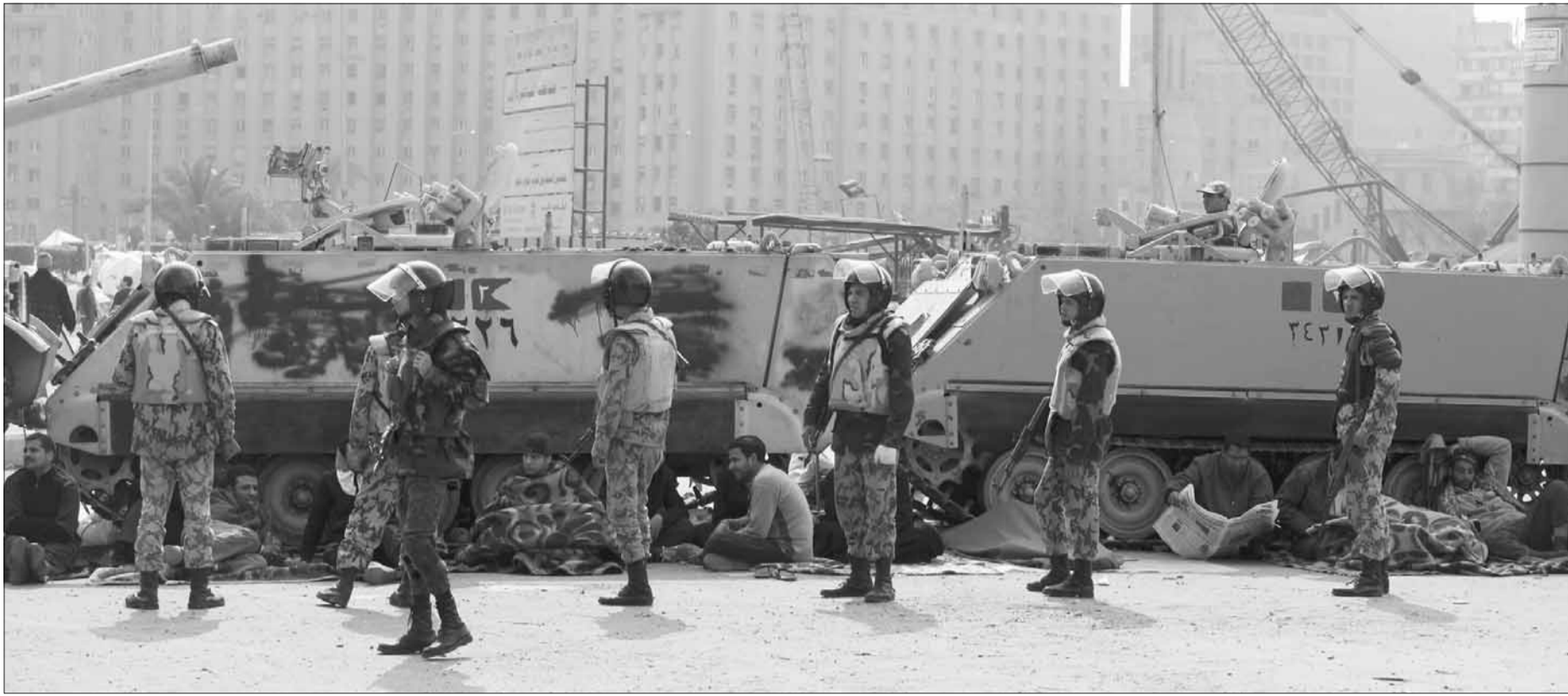
PROTESTERS gather around army vehicles at Tahrir Square in Cairo yesterday to prevent the army from moving towards the square and placing barbed wires.