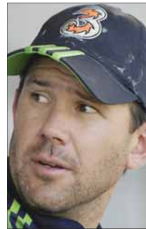
Ponting said he had endured a frustrating month on the sidelines, but believed the way the team had performed in his absence, thrashing England 6-1 in their ODI series, showed they were ready to defend their crown. "I'm really proud of the way the boys have played in

Australia go into the World Cup, to be played in India, Sri Lanka and Bangladesh, in search of a fourth consecutive title.