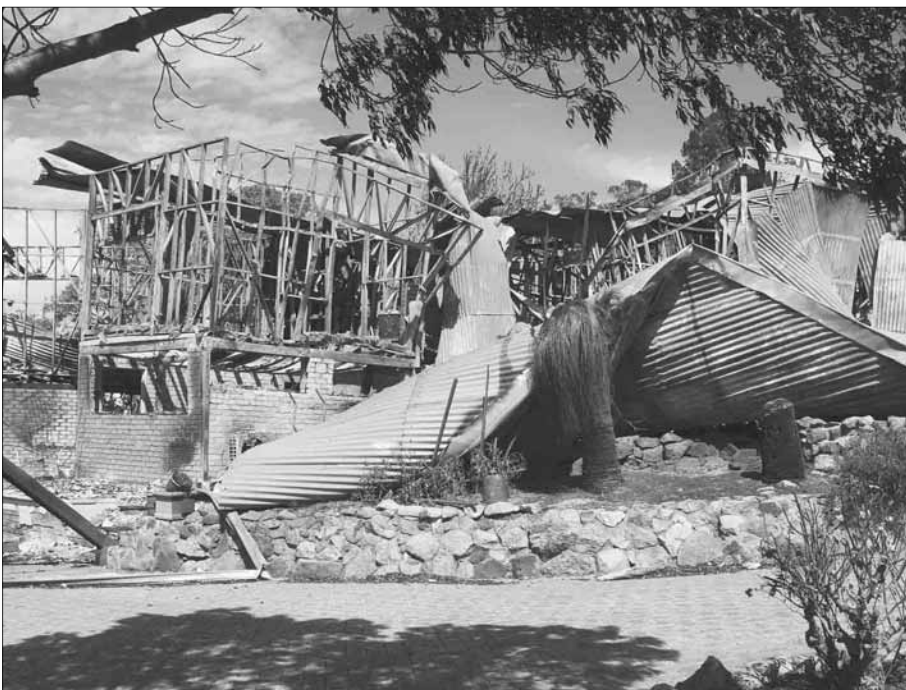
A HOUSE stands among bushfire devastation in the foothills suburb of Roleystone, a suburb of Perth, yesterday. — AFP

US has signalled it is ready to remove Sudan from its list of state sponsors of terrorism after a successful referendum, and help in easing crippling trade sanctions. — Reuters