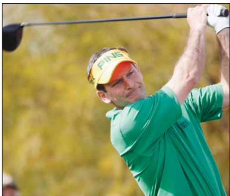
MARK Wilson of the US tees off on the eighth hole during the third round of play in the PGA Phoenix Open in Scottsdale, Arizona.

last two or three years. This kind of adds to that," Dufner said. "I'm kind of tired of being close, so hopefully I can get one done sometime this year."