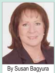
By Susan Bagyura

Your difference between interest and commitment will show up in the difference between success and mediocrity in all areas of your life. Put a little in; get a little out. Put a lot in; get a lot out