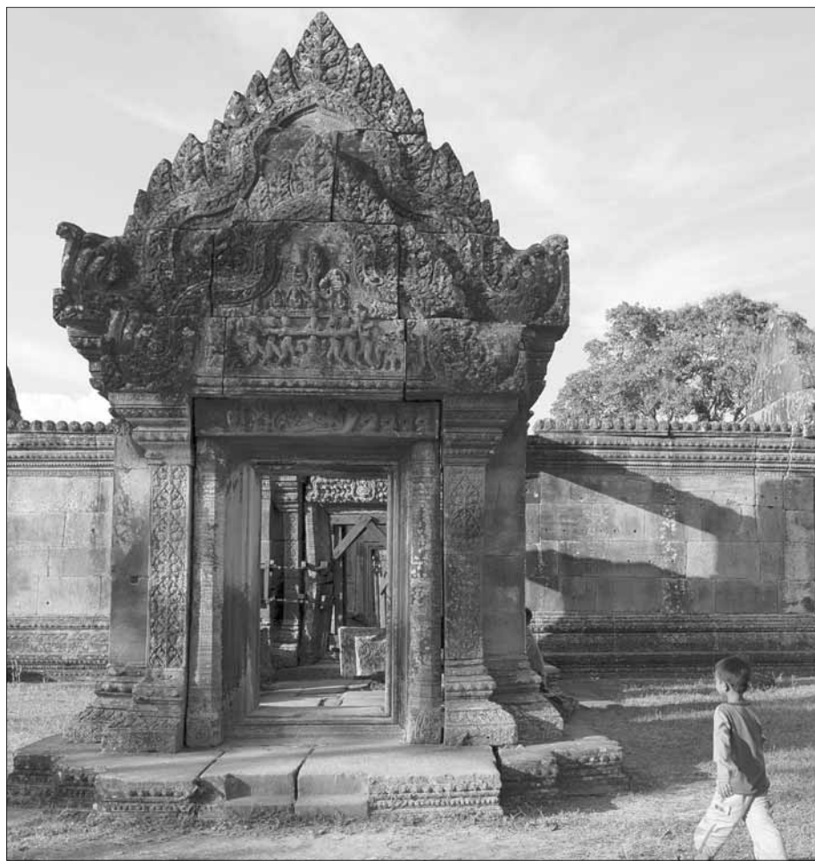
A CAMBODIAN boy walks through the grounds of the Preah Vihear temple in Preah Vihear province, some 500 km north of Phnom Penh, on the disputed border with Thailand.