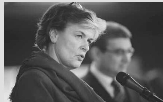
FINNISH Minister of Migration and European Affairs Astrid Thors (L) addresses the media next to Romanian Foreign Minister Teodor Baconschi in Bucharest yesterday. In their talks, the two officials reviewed the state of bilateral relations and a range of topics of common interest on the European agenda.