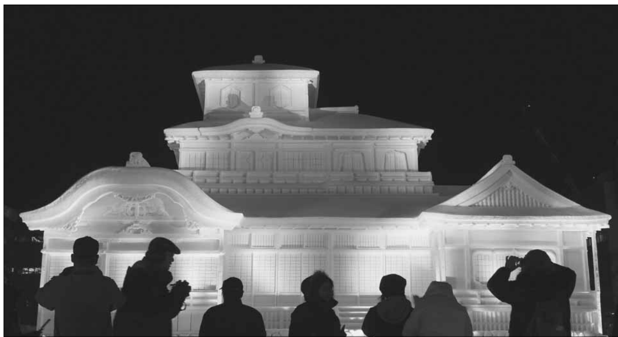
VISITORS look at an illuminated snow sculpture of Japan's national treasure "Hiunkaku of Hongwanji" at the 62nd Sapporo snow festival in Sapporo, on Japan's northern island of Hokkaido, yesterday. About 250 snow and ice sculptures are exhibited in one of Japan's popular winter events which is held until February 13.