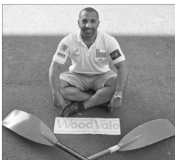
This is in contrast to sculling when a rower has two oars, one in each hand. In the UK the term is less used as the

Sweep or sweep-oar rowing is a type of rowing when a rower has one oar, usually held with both hands. As each rower has only one oar, the rowers have to be paired so that there is an oar on each side of the boat.