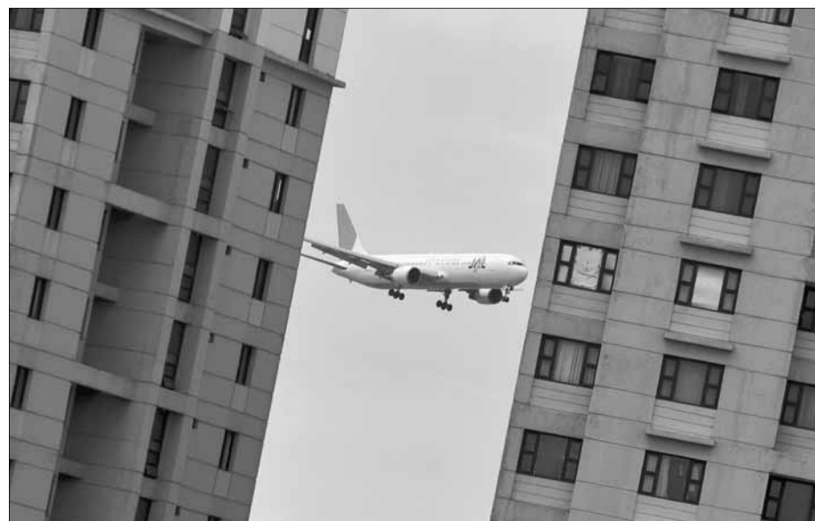
A JAPAN Airlines plane passes behind buildings before it lands at the Manila International Airport in Manila yesterday. Planes operating at the Philippines' main airport are facing a growing danger from waterbirds, authorities said. — AFP

"These pigeons would descend in large flocks. We have asked the local governments to discourage residents from raising birds, but truth to tell, there is no ordinance right now that bans the practice," he said. — AFP