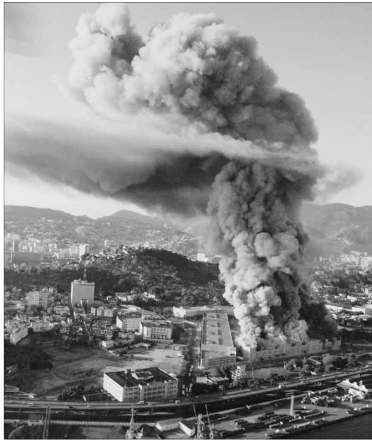
AN aerial view from a helicopter shows smoke billowing from a fire raging through samba schools, where floats, costumes and props of the Rio Carnival are made and kept, in Rio de Janeiro yesterday.

Police said they believed it unlikely to have been a deliberate act, even though several of the clubs — called samba schools — that put on the Carnival parades have links to criminal