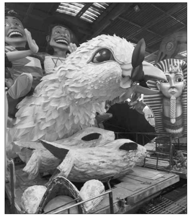
CARNIVAL floats kept ready in Nice, southeastern France, yesterday. The 127th edition of the Nice's Carnival, celebrating the "Mediterranean King", will start on February 18 and run until March 8.

Cambodia has accused Thailand of damaging the ancient stone temple in the latest unrest. Local sources have reported seeing shells scattered around the grounds and lodged inside temple walls. — AFP