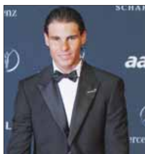
RAFAEL Nadal arrives for the Laureus World Sports Awards.

There was a rapturous welcome for Zinedine Zidane, who received the Lifetime Achievement Award in recognition of his remarkable career. The Spirit of Sport Award was presented to the European Ryder Cup Team to mark their emotional win over the United States in a match "which demonstrated great sportsmanship, golf played at the highest level and