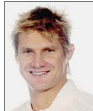
fourth highest wicket-taker over the same period.

Despite opening the batting, Watson also took 47 wickets at an average of 26.53 for his country, Australia's