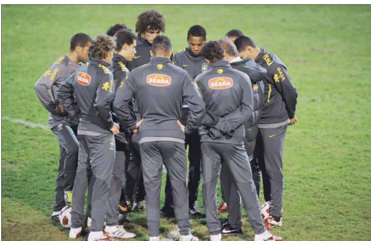
PLAYERS of the Brazilian national team gather yesterday during a training session at the Jean Blot stadium in Coubevoie, outside Paris, two days before the friendly match against France. PICTURE RIGHT: French national team's forward Karim Benzema (centre) talks with defender Eric Abidal (right) and Florent Malouda during a training session in Clairefontaine.

PARIS — France will use tomorrow's friendly against Brazil as a chance to measure themselves against the best and gauge their progress since last year's disastrous World Cup.