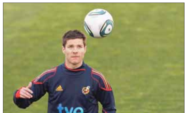
SPAIN'S Xabi Alonso takes part in a training session at the Spanish Soccer Federation headquarters in Las Rozas, outside Madrid, PICTURE RIGHT: Spain's coach Vicente del Bosque takes part in the training. Spain will face Colombia in a friendly match at Madrid's Santiago Bernabeu stadium tomorrow.

Del Bosque, awarded the honorary title of Marquis by