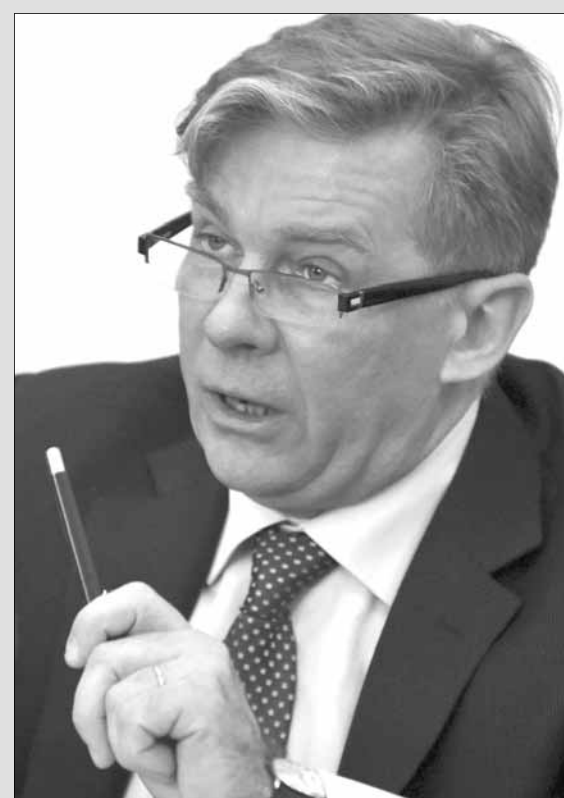
LITHUANIAN Minister of Foreign affairs and Chairperson-in-Office for the Organisation for Security and Co-operation in Europe Audronius Azubalis speaks with his Ukrainian counterpart Kostyantyn Gryshchenko (unseen) during their talks in Kiev yesterday. Azubalis is in Ukraine for a three-day official visit.