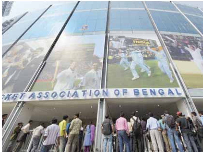
JOURNALISTS wait outside the Eden Gardens stadium in Kolkata, as International Cricket Council (ICC) observers visit the stadium yesterday. Three-member ICC team visited the ground to decide the possibility of hosting three other non-India World Cup matches at this venue.