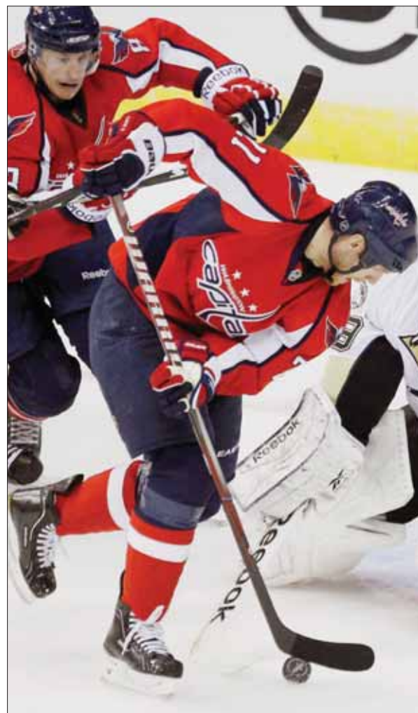
BROOKS Laich of the Washington Capitals scores against Pittsburgh Penguins during their NHL game in Washington on Sunday. — Reuters

The Black Eyed Peas performed a dazzling half-time show. — Reuters