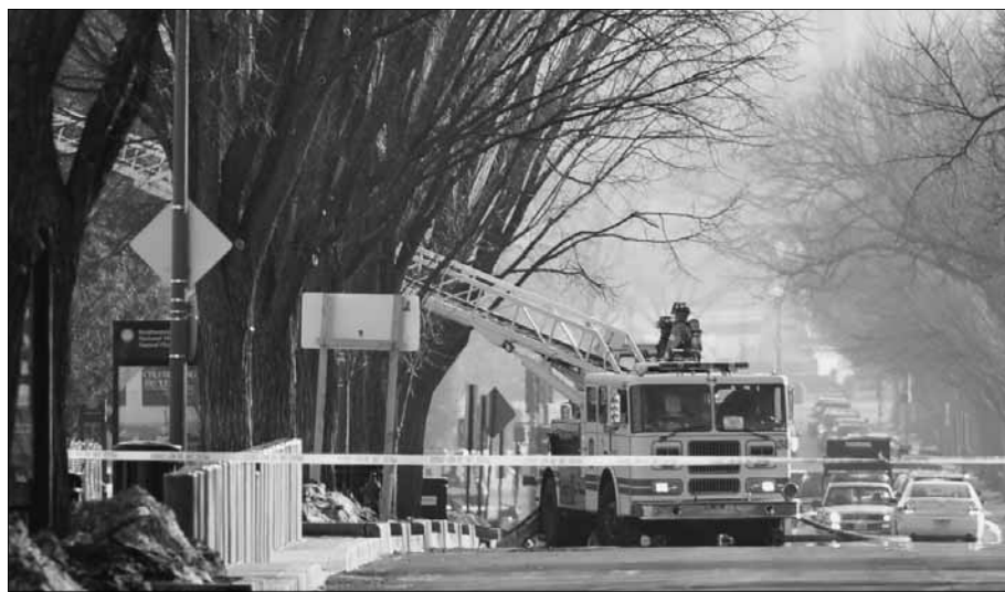
A FIRE broke out yesterday in a Smithsonian museum in the US capital, but was swiftly extinguished with no injuries or damage to the collections reported. — AFP

She also takes keen interest in the rest of Latin America. She influenced the debate in Washington over the 2009 ouster of Honduran President Manuel Zelaya by insisting it was not a coup, but a legal exercise of power. This month she urged the Obama administration not to pressure Honduras into letting Zelaya return home without him facing corruption charges. — Reuters