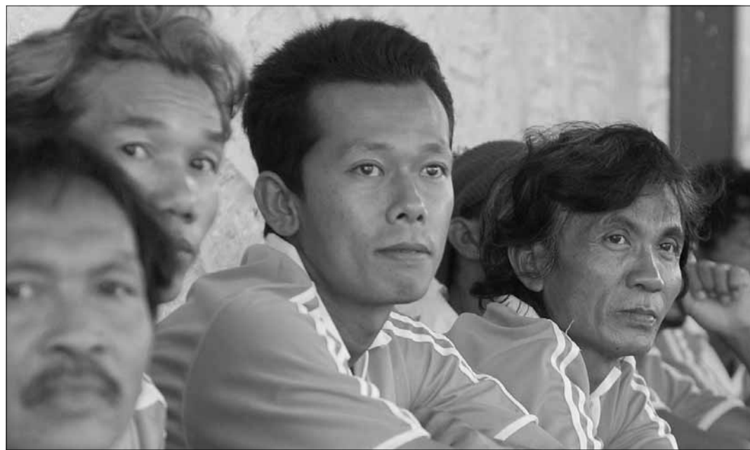
RESCUED crew members of a Thai fishing vessel that was hijacked off the Somali coast six months ago at a police station in Mumbai yesterday. The 28 Thai and Myanmar crew were among 52 people taken off the vessel and brought to Mumbai for questioning. A Mumbai magistrate yesterday remanded an Ethiopian and 14 Somali pirates to judicial custody for seven days. — AFP

Two CID officials started following the tyre marks of the Gypsy and reached Sector 20. They found the accused were trying to tow the Gypsy away with an auto-rickshaw. They immediately nabbed the two and handed them over to Chandigarh Police.