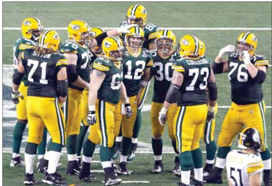
GREEN Bay Packers team celebrate their win over the Pittsburgh Steelers in the closing moments of the NFL's Super Bowl game in Arlington, Texas, on Sunday. PICTURE CENTRE: Green Bay Packers' quarterback Aaron Rodgers holds up the trophy. PICTURE RIGHT: Rashard Mendenhall (left) of the Pittsburgh Steelers avoids a tackle by Desmond Bishop of the Green Bay Packers.