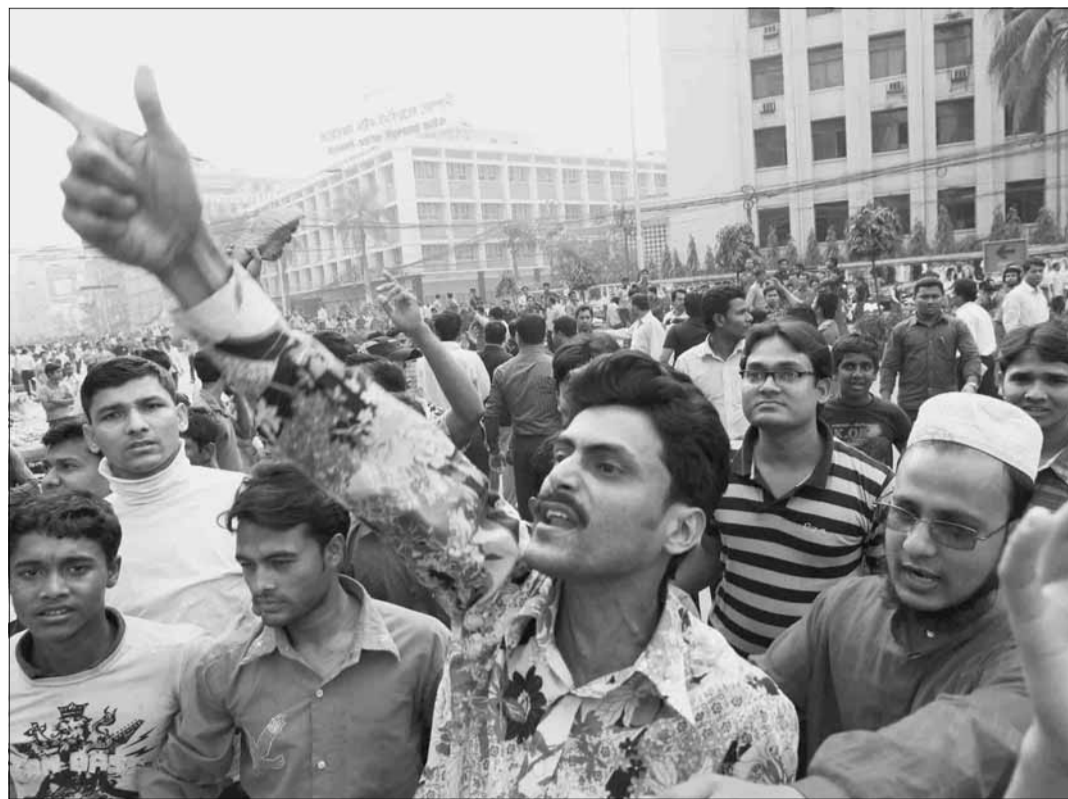
INVESTORS protest in front of the Bangladesh Bank as they take part in a strike called by the Bangladesh Nationalist Party in Dhaka yesterday.

He said that he had been fond of using wooden things since his childhood, thus he preferred to manufacture these wooden locks by using old diyar wood. The artisan urged the officials concerned of the Guinness Book of World Records to include his name for setting these manufacturing records.