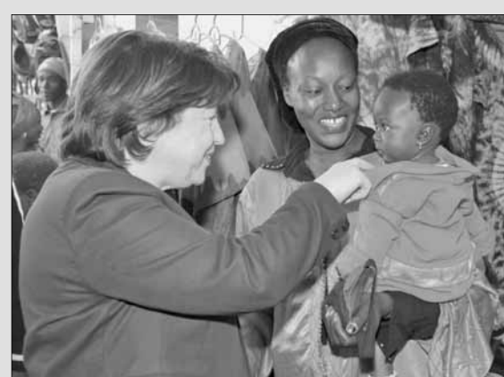
FRENCH Socialist Party leader Martine Aubry talks to a girl during a visit to the Kernel market on the sidelines of the World Social Forum, an annual leftist gathering, yesterday in Dakar. The 11th edition of the forum brings together anti-globalisation activists opposed to capitalism.