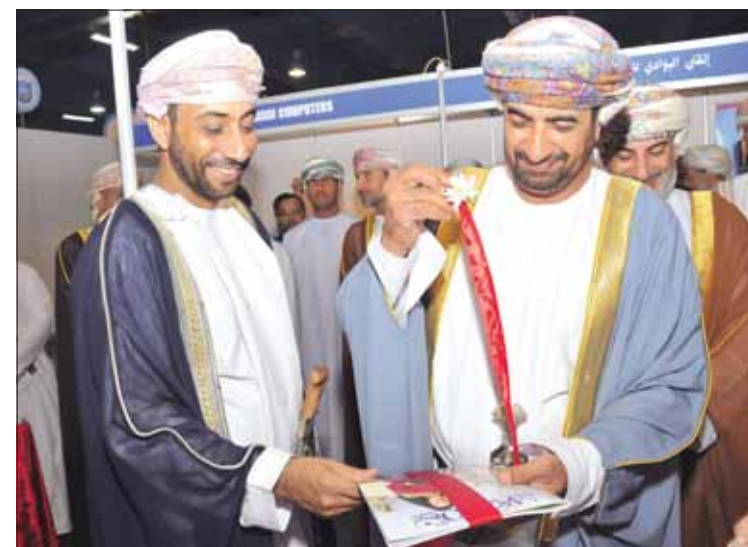
OMAN Daily Observer launched a monthly lifestyle magazine Mazoon in Muscat yesterday. It was released by Sayyid Khalid bin Hilal al Busaidi, Secretary-General of the Council of Ministers. ■ See pages 25, 27