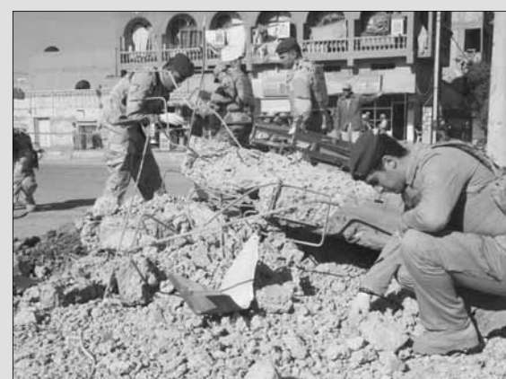
IRAQI personnel from the Explosive Ordnance Disposal unit inspect the site of a bomb attack in Baghdad's Sadr City yesterday. A roadside bomb went off near an Iraqi army patrol, wounding two soldiers and two civilians, in Baghdad's northeastern Sadr City district, local police said.