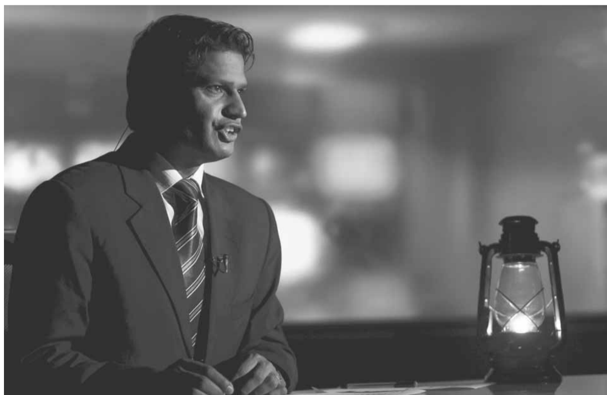
A NEWS reader from national television channel Kantipur Television reads the news beside a lantern in Kathmandu. The television channel is highlighting the Nepal Electricity Authority’s daily 14-hour load shedding introduced on its customers. The authorities said the generation of power has gone down due to the less water available from the rivers to generate power.