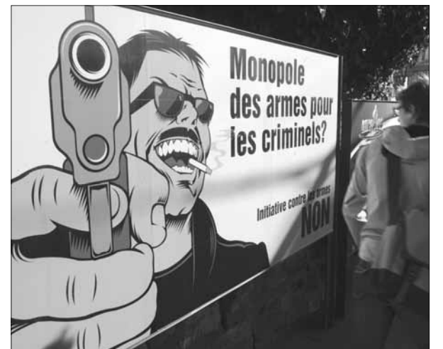
THE 'Initiative for the prevention of violence with weapons' posters yesterday in Lausanne. Swiss citizens will vote on February 13 on an initiative that aims to have Swiss soldiers keep their personal army rifle in an arsenal instead of their home in order to prevent suicides and family tragedies, according to the initiative's instigators. — AFP

Participants were given 30 minutes to dig as deep as possible. Regulations govern the size of shovels, which are measured before the contest kicks off. Throwing dirt into a competitor's hole is, of course, strictly forbidden. — Reuters