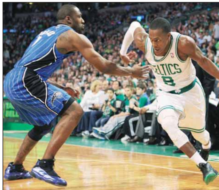
BOSTON Celtics point guard Rajon Rondo (right) drives around Orlando Magic point guard Gilbert Arenas in the second half of their NBA game in Boston, Massachusetts, on Sunday.

Dwight Howard had 28 points and 13 rebounds for Orlando (32-20) but the visitors fell behind by 15 points in the