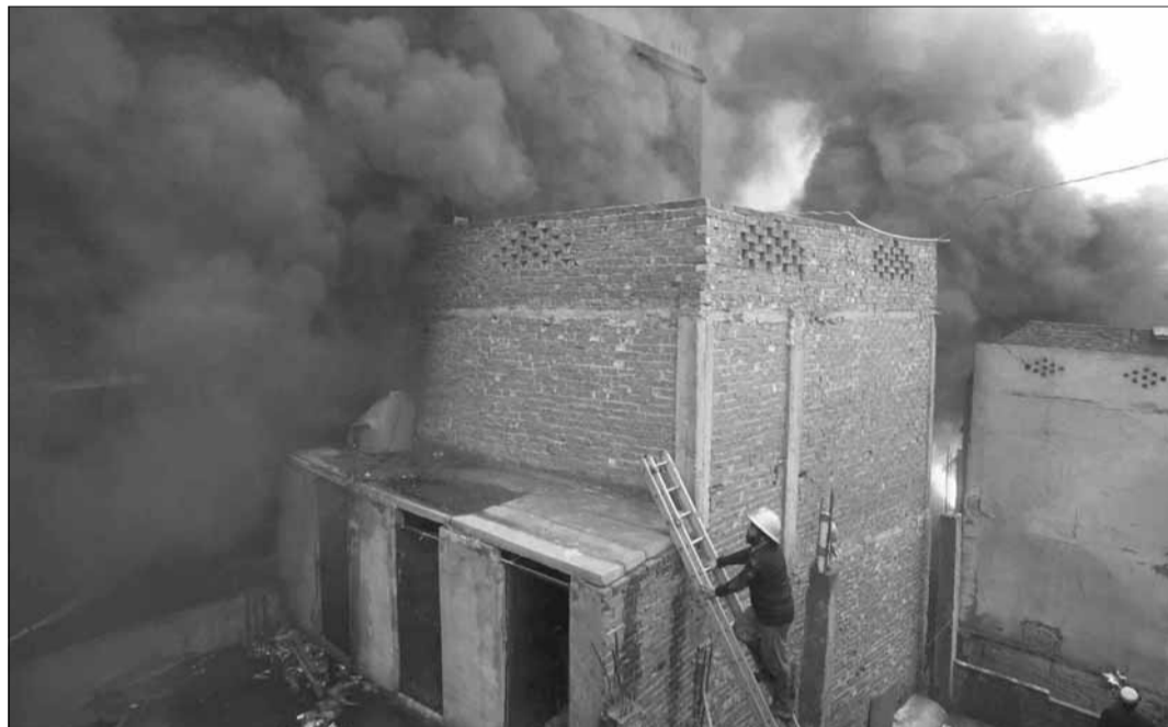
A FIREFIGHTER climbs up a ladder to extinguish a fire at the Shah Alam Market in Lahore yesterday.

Officials said that they were estimating the losses caused by the massive fire, which took place in an area famous for wholesale businesses.