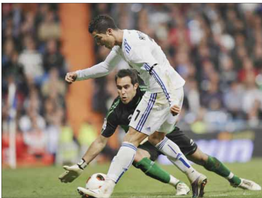
REAL Madrid's Portuguese forward Cristiano Ronaldo (right) vies with Real Sociedad's Chilean goalkeeper Claudio Bravo during the Spanish league match at the Santiago Bernabeu stadium in Madrid on Sunday. Real Madrid won 4-1.

Valencia have now won six of their last seven games and