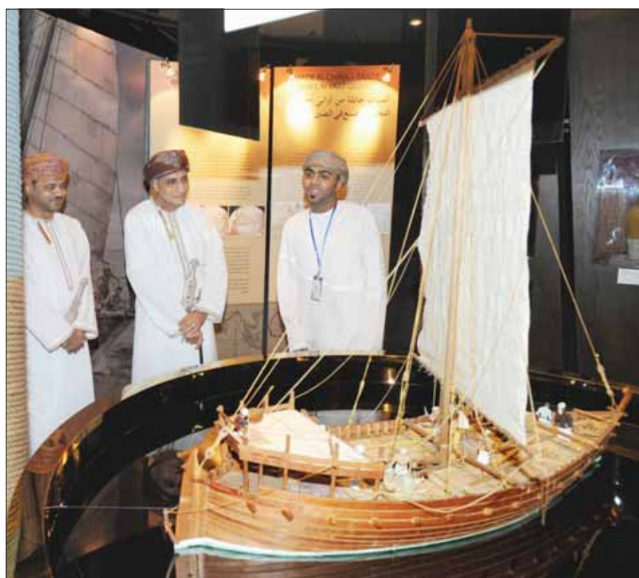
HH Sayyid Fahd bin Mahmood al Said, Deputy Prime Minister for the Council of Ministers, toured the 'Ancient Treasure Ships Exhibition' in Muscat yesterday. ■ Details on page 2

www.omanobserver.om • editor@omanobserver.om