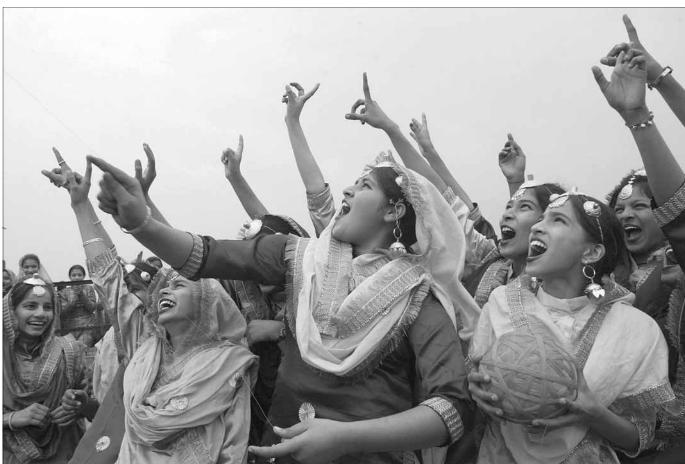
SCHOOLGIRLS cheer as they fly a kite during an event to mark the Basant or spring festival in Amritsar yesterday. Basant is celebrated mainly in Haryana and Punjab marking the start of the spring season.