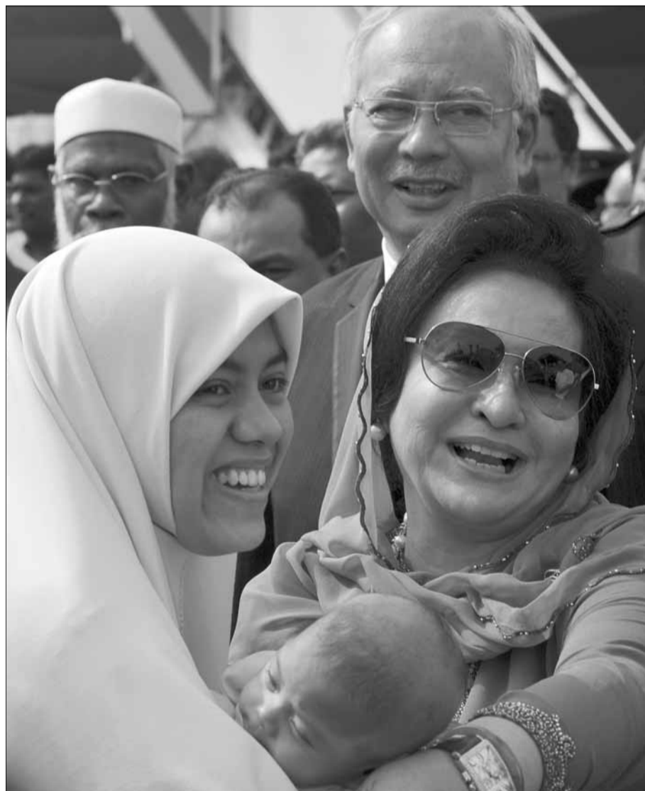
MALAYSIAN Prime Minister Najib Razak's wife Rosmah Mansor plays with a child of a passenger returning from Egypt at the VVIP terminal in Kuala Lumpur yesterday. According to an English daily, Najib has warned against any attempt to usurp power in Malaysia, using demonstrations like those in Egypt.

"Therefore, there is no reason to deal hypothetically with this question." Mubarak has previously sought medical treatment in Germany, and in March 2010 spent three weeks at clinic in Heidelberg when he had his gall bladder removed.