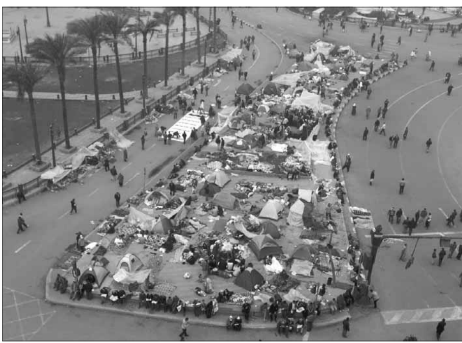
DEMONSTRATORS camp in Tahrir Square yesterday on the 14th day of protests.

The 28-nation North American and European alliance is following the situation in Egypt and other countries in the region "with great interest", the secretary general said. — AFP