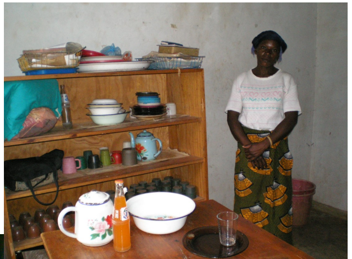
kitchen supplies...all cooking would be done outside on fire.