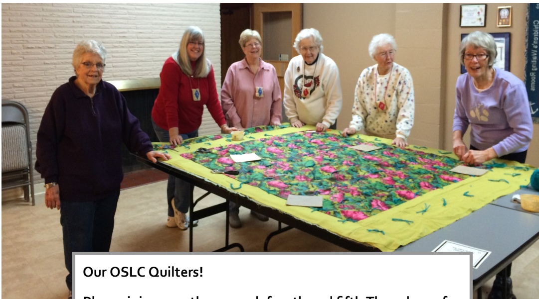
Our OSLC Quilters!

- Simply Givers , if you are changing your giving amount for 2015, please fill out a new form. Please talk to Beth if you have questions.