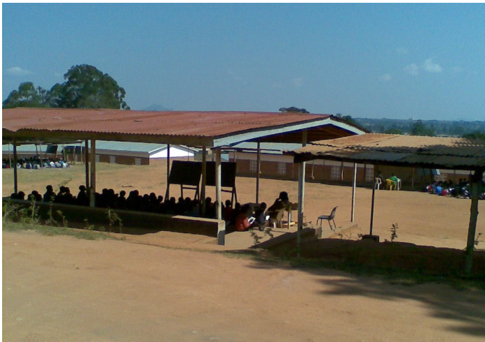
Children in Class