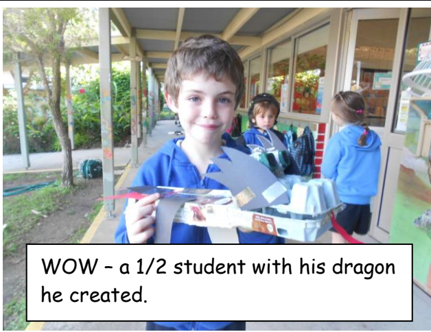
WOW - a 1/2 student with his dragon he created.