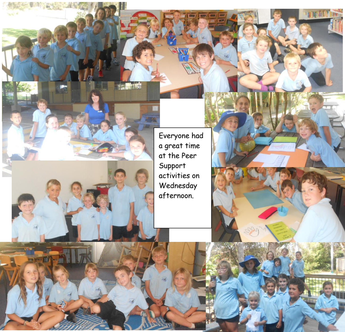
Everyone had a great time at the Peer Support activities on Wednesday afternoon.