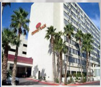
Crowne Plaza Hotel PHOENIX-AIRPORT 4300 EAST WASHINGTON PHOENIX, AZ 85034

The Crowne Plaza Hotel is proud to be the "Official Hotel" of the 2007 Herb Sendek Basketball Camps.